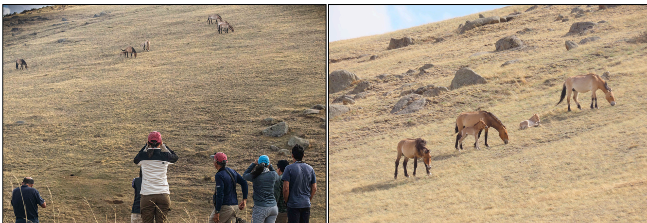
Watching Przewalski's Horses in Hustai National Park.