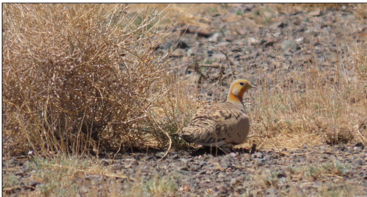
Pallas's Sandgrouse.

After exiting the canyon on foot, we could see the rising sand dunes in the distance. We piled back into the vehicles and in no time, we found ourselves in Mongolian Ground-Jay habitat. After some searching, our entire group got great looks at at least one individual running around on the ground not far from our cars. We also got nice views of several small groups of Pallas's Sandgrouse flying and walking along the ground.