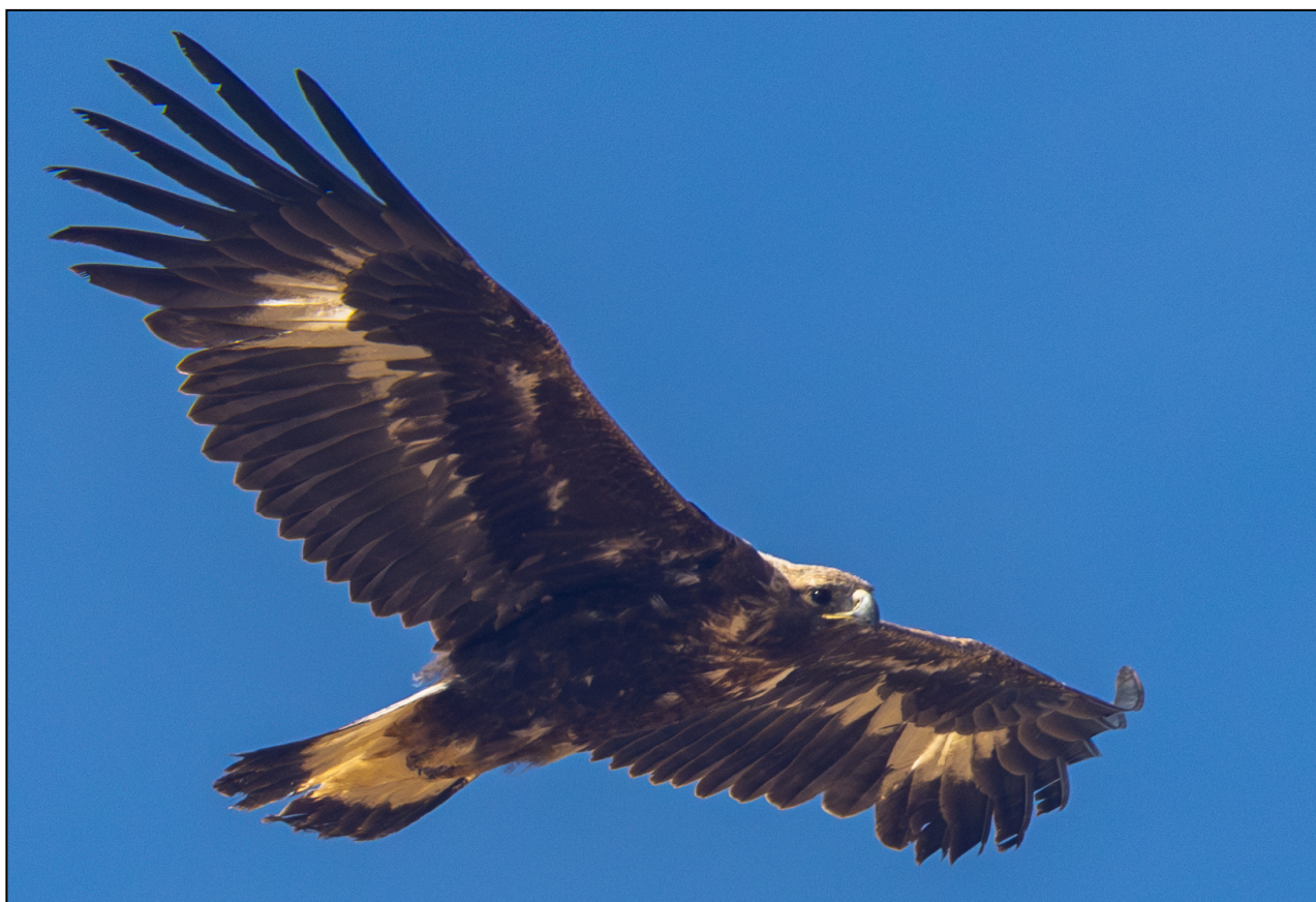
One of many Golden Eagles seen during the tour.

Because we hadn't had any luck spotting woodpeckers the day before, we decided to make a final stop at a nice forest just outside of Ulaanbaatar. Here, we picked up three new species for the trip Taiga Flycatcher , Willow Tit , and Great Spotted Woodpecker , bringing our total of bird species observed to 108! After a nice lunch in Ulaanbaatar, most of the group headed to the Black Market to do some last minute shopping. The traffic returning to our hotel was typically heavy, but we made it in time for a hot shower and some rest before our final dinner together.