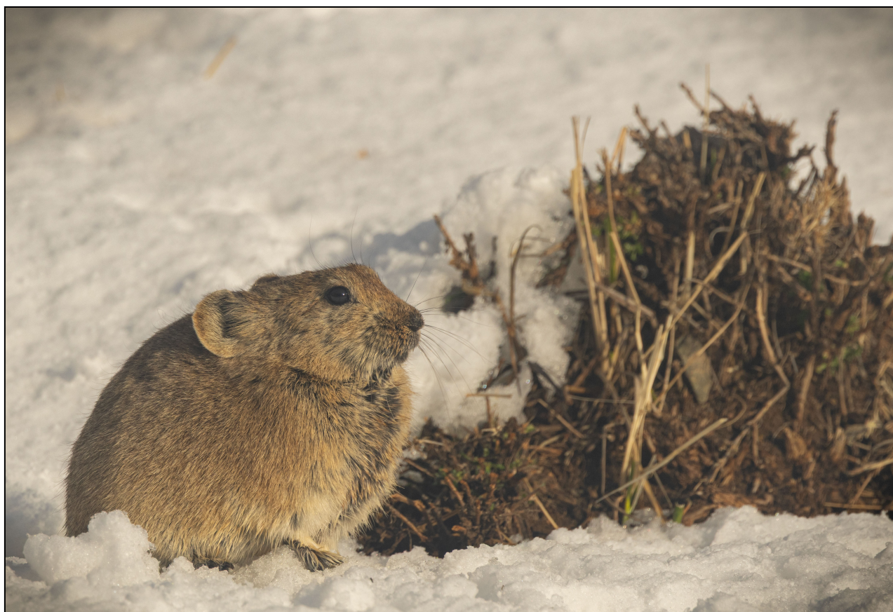
Pallas's Pika at Yol Valley.