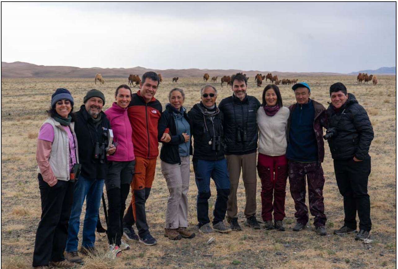
One last group photo, minus the photographer.