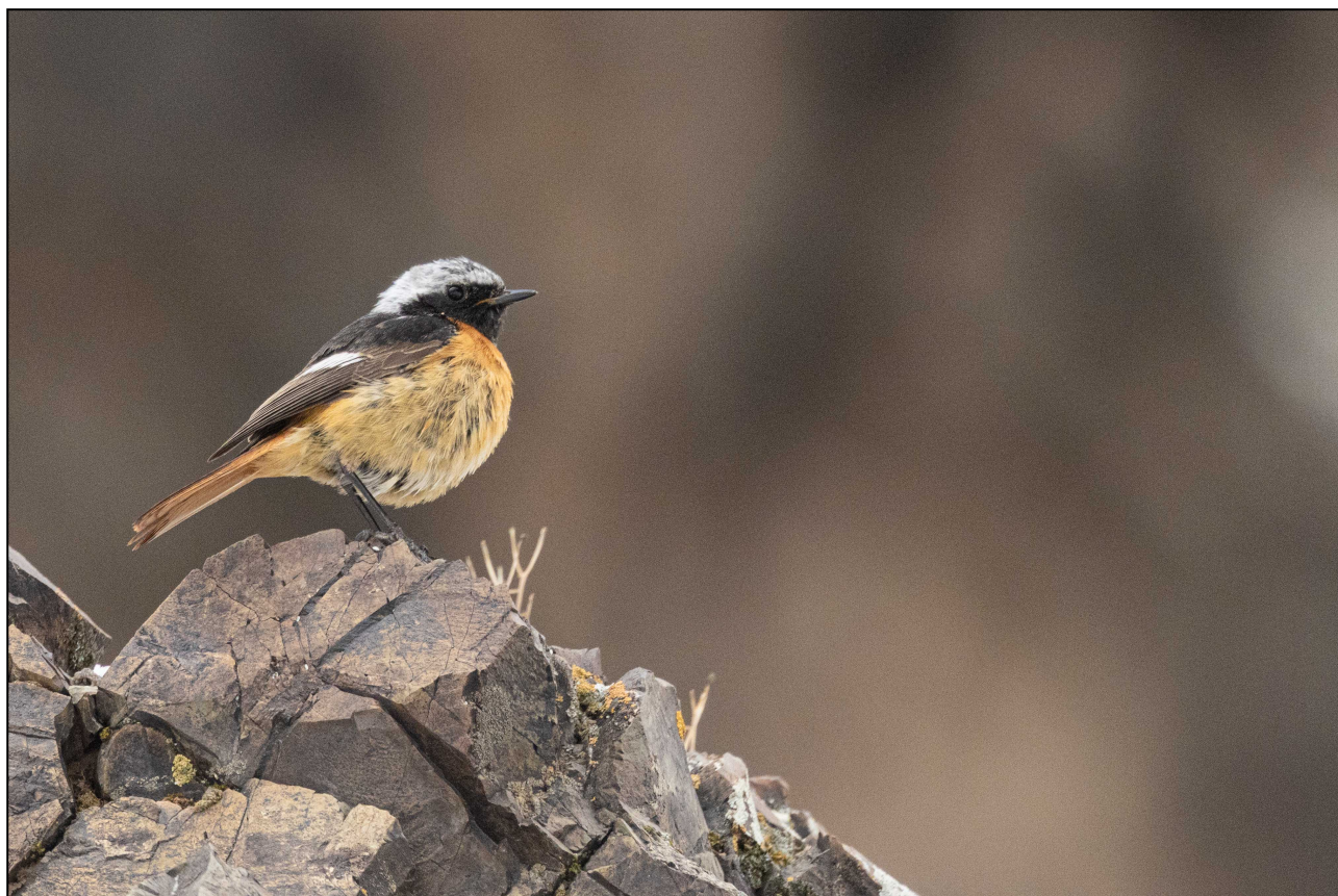
Daurian Redstart.

The second group had an early morning start (5 a.m.) and drove about 2 hours to search for the Black-billed Capercaillie . On the drive there and back, we spotted a few bird species including Ruddy Shelduck , Cinereous Vulture , Western Marsh Harrier , Horned and Crested larks , and Isabelline and Northern wheatears . We also spotted Long-tailed Ground Squirrels running across the open steppe. When we arrived at the area, we had walked for less than 5 minutes when our local guide, Ganaa, stopped and signaled for us to listen. We could easily hear one calling not too far off in the distance. As we approached, we were treated with an amazing sight - one large male walking among the trees, just off the small road. We watched it for several minutes as it spread its tail feathers, lifted its head to call, and occasionally made short vertical flights. We hadn't been there long when we spotted 3 more males a bit further away. The excitement built as another male approached and began sparring briefly with the first male we had been watching. We spent a few moments watching from a far. We then left and headed out to meet the rest of the group. As we were getting ready to get into the car, we heard and saw a Red-throated Thrush calling from