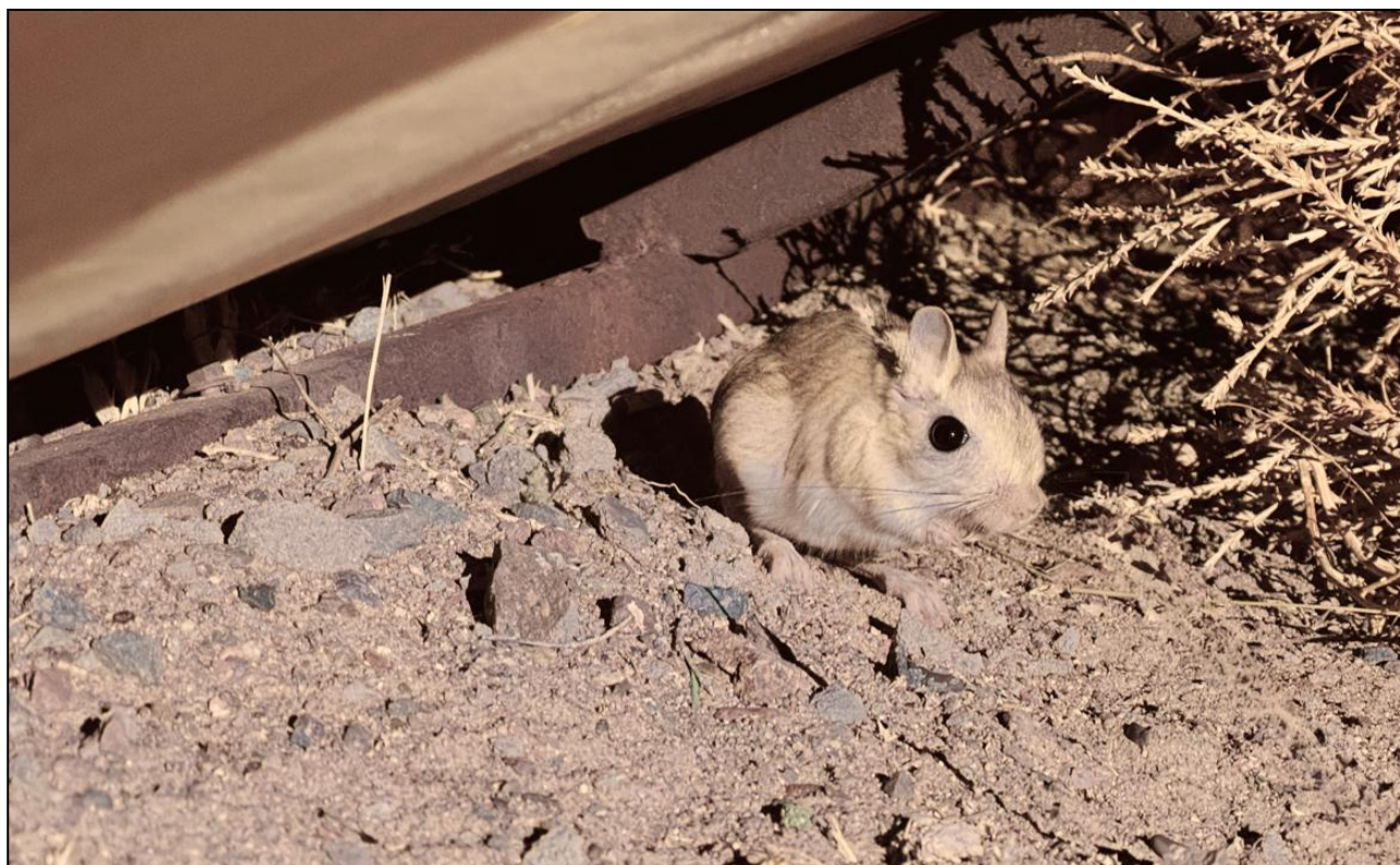
Hairy-footed Jerboa seen at Ongi River.

We continued on our way towards the Ongi River, making a stop at a lovely wetland area for lunch. Here, we picked up some more species for the trip including, Bar-headed Goose , Graylag Goose , Black-winged Stilt , and Common Crane . We also saw Demoiselle Cranes , Northern Shovelers , Northern Lapwings , and Black-headed Gulls . Along the way, we also spotted a