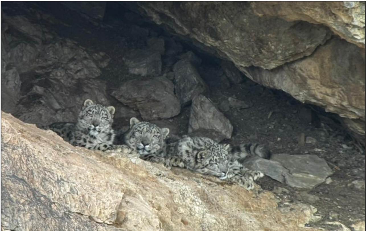
Three Snow Leopards (a mother and 2 cubs) seen during our tour.

I think it is safe to say that Mongolia exceeded everyone's expectations. During our 15-day tour, we had the opportunity to explore the fantastic, expansive, and constantly shifting scenery on our drives across desert landscapes and vast steppes, and through rugged canyons, and alongside rocky cliffs. We experienced diverse weather (sunny days, snow, dust storms, high winds, and rain), and incredible cultural experiences. We stayed with a nomad family in the Gobi learning about milk and cashmere production, and sharing meals with our generous hosts. We walked through beautiful, snow-covered valleys, climbed granite peaks, visited museums, monasteries, and the famous Black Market, as we immersed ourselves in Mongolian culture and history. We also had some incredible wildlife sightings - we observed 25 species of mammals and 108 bird species during our tour.