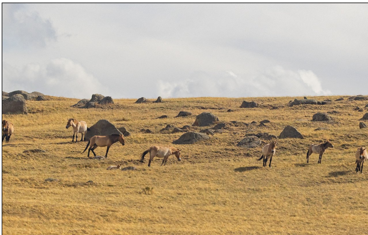
A herd of Przewalski's Horses seen at Hustai National Park.