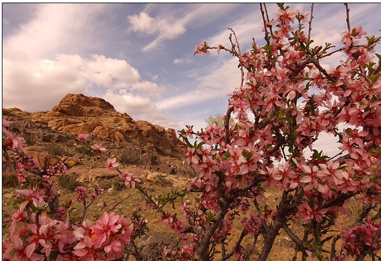
Mongolian Almond in bloom.

We had a leisurely start this morning. Our first stop was a visit to the beautiful Erdene Zuu Monastery, which is believed to be the oldest surviving Buddhist monastery in Mongolia. We visited the temples, were amazed at the stunning architecture, observed a morning Buddhist ritual, and had some time to purchase souvenirs before our departure. We left the area around 11:30, stopping for lunch at local restaurant, before continuing on to Takhilt Lake, a beautiful wetland area right at the edge of some sand dunes. While several of the group decided to continue on to do some hiking in the nearby mountains, a few of us stayed behind to bird the wetlands. We got several new species for the trip including Swan Goose , Arctic Loon , Eared and Great-crested grebes , Eurasian Coot , Oriental Turtle-Dove , and White-naped Crane . Then we all met up and explored the beautiful granite cliffs behind the sand dunes. They were dotted with yellow and green lichens and surrounded by beautiful Mongolian Almond trees in bloom.