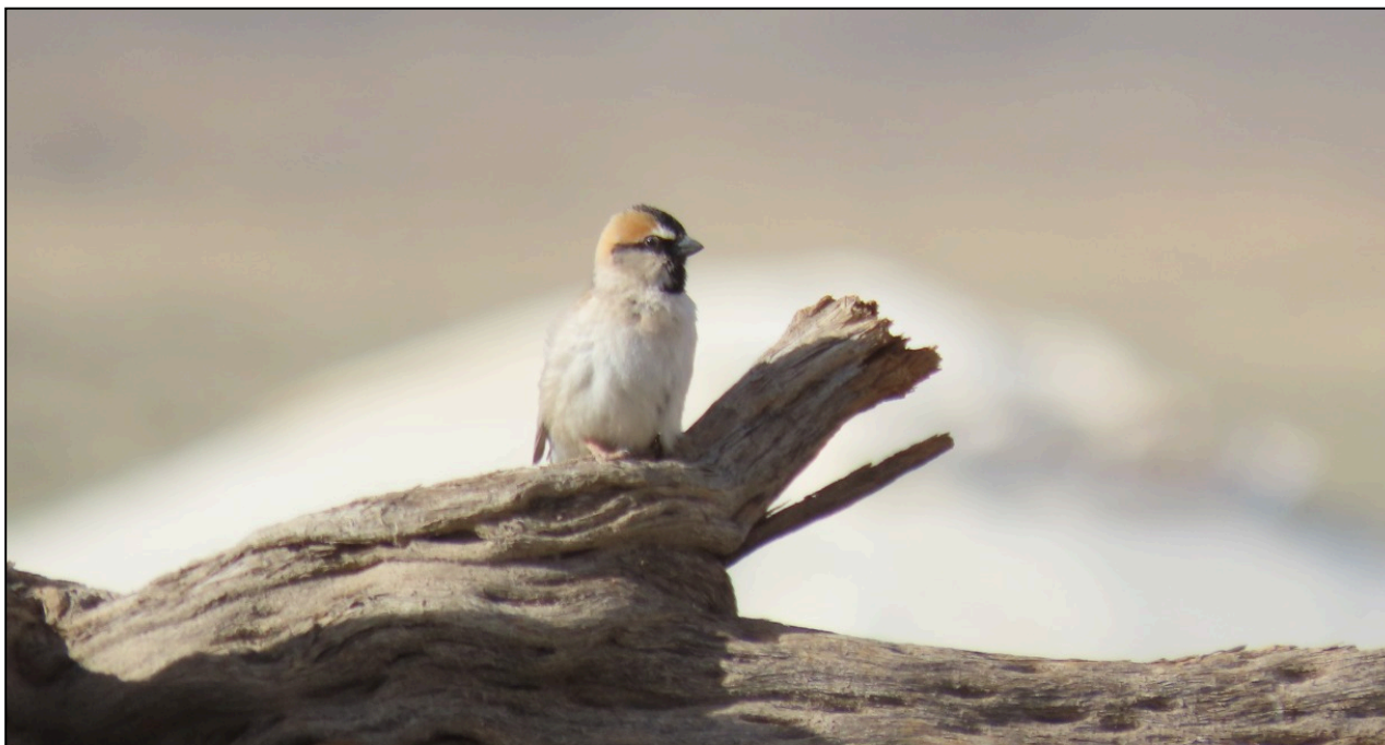
Saxaul Sparrow.

We eventually reached the Khongor Sand Dunes later in the afternoon. After parking our vehicles, we walked past a small wetland, where we spotted Northern Lapwings in the distance. We left our shoes behind and began the slow and steady climb up the “singing sands.” Apart from a small group of tourists, we had this lovely area all to ourselves. We enjoyed the stunning views from the top of the dunes, and after several minutes, ran down the sandy slopes. It took us about 20 minutes to climb to the top and perhaps 5 to make it down! Afterwards, most of the group returned to camp to rest. A few stayed back to search for the localized Saxaul Sparrow . We got great looks at several of them, as well as Greater Short-toed Lark and Red-tailed Shrike , to boot.