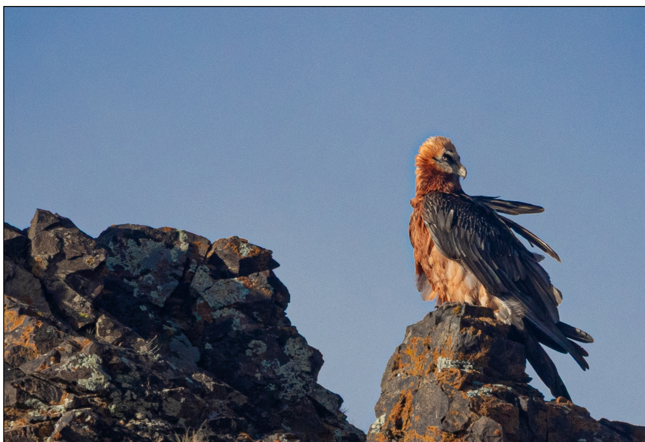
A stunning Bearded Vulture, astounding our group with its bright rust-colored feathers.

Back in the vehicles, we drove for another half hour or so before arriving at an active Bearded Vulture nest. We immediately found the adult perched up on a cliff. This was a particularly lovely individual and the reddest one any of our group had ever seen, including the guides. Climbing up a hillside across and a good distance from the nest, we were able to see that there was a sleeping nestling tucked inside. Thanks to Tenan's expertise with this species, we estimated the young to be approximately 70 days old.