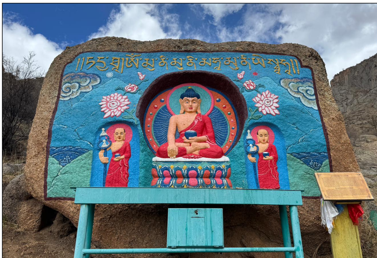
On the trail to the Aryabal Meditation Temple.

Today we left our hotel around 8 a.m., after a nice breakfast. We drove through Ulaanbaatar to arrive at Gorkhi Terelj National Park. Our first stop was at the famous Turtle Rock. Here, many of the group climbed the granite rocks to enjoy a bit of a view from above. We then drove another 20 minutes or so and parked at the entrance to the Aryabal Meditation Temple. Here, we climbed up the a series of stairs marked by signs with over 140 Buddhist teachings, and the final 108 steps to reach the meditation temple. On the walk up, we observed a new mammal from the trip, Siberian Chipmunk .