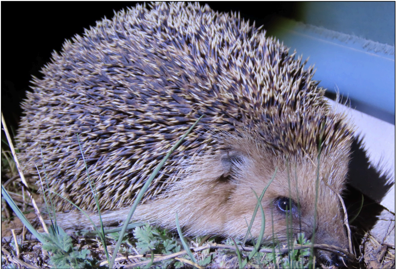
Daurian Hedgehog.