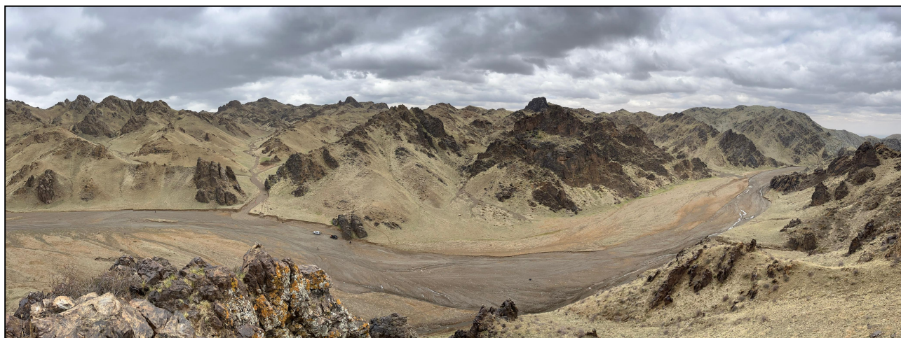
A breathtaking view atop a hill in Three Beauties of the Gobi NP.

Though the snow leopard cave was still empty, we enjoyed exploring the nearby surroundings. Several of us took a hike up to a nearby mountain top. Along the way, we had terrific views of the valleys below. Angel spotted an active Cinereous Vulture nest, we found evidence of snow leopards (old scratching and scat), and had wonderful views of an Upland Buzzard soaring past. Others decided to walk along the dry river bed, or just along the base of the slopes, enjoying the stunning mountains, rugged rock-faces, and beautiful, low-growing wild flowers.