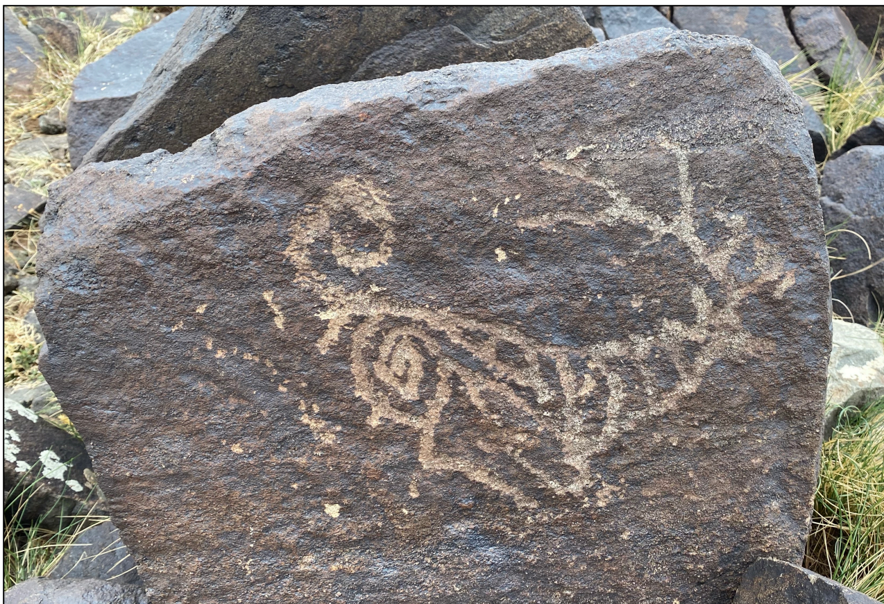
An example of the many petroglyphs seen at Havtsgait.

Afterwards, we decided to visit the Havtsgait Petroglyphs site which boasts an incredible collection of early bronze-age rock carvings, in hopes the weather would clear eventually, and that wildlife watching would be a bit easier. Along the way, we stopped at a site with several abandoned buildings (an old meeting place for nomad families). There we saw several Lesser Kestrels , and also picked up Hill Pigeon for our list. We then drove another 15 minutes or so and parked our cars beneath a small hill. Several of us climbed the short, but steep incline and were rewarded with incredible views of the mountains behind us and open steppe almost as far as the eye could see.