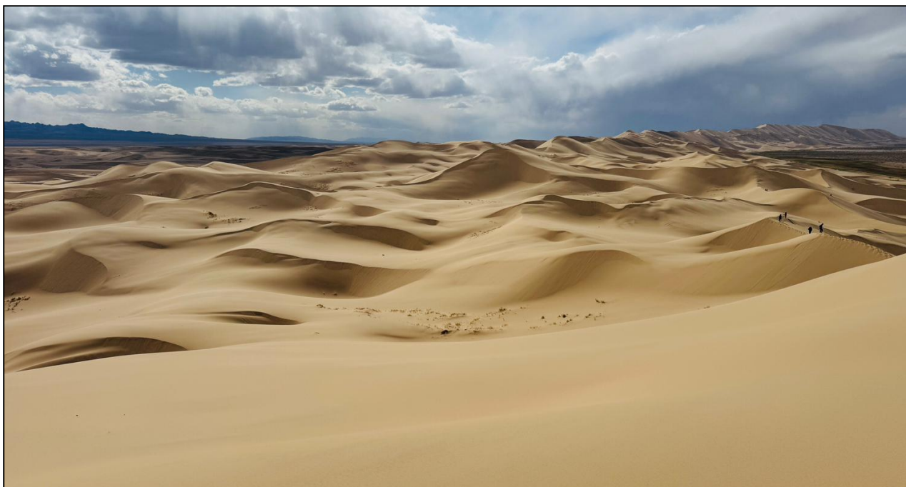
Khongoryn Els (Khongor Sand Dunes NP).

We eventually reached the Khongor Sand Dunes later in the afternoon. After parking our vehicles, we walked past a small wetland, where we spotted Northern Lapwings in the distance. We left our shoes behind and began the slow and steady climb up the “singing sands.” Apart from a small group of tourists, we had this lovely area all to ourselves. We enjoyed the stunning views from the top of the dunes, and after several minutes, ran down the sandy slopes. It took us about 20 minutes to climb to the top and perhaps 5 to make it down! Afterwards, most of the group returned to camp to rest. A few stayed back to search for the localized Saxaul Sparrow . We got great looks at several of them, as well as Greater Short-toed Lark and Red-tailed Shrike , to boot.