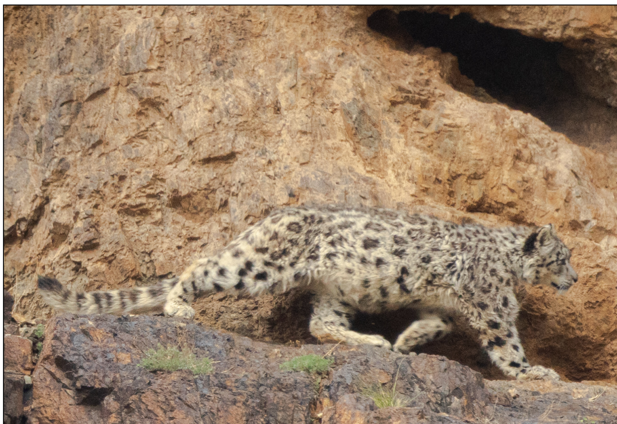
One of two Snow Leopard cubs walking into a cave to join its mother.

Before heading back for lunch, we decided to make one more stop at the snow leopard cave. No sooner had we arrived, than Ganaa spotted an adult female Snow Leopard peering out from the large, rocky cavity. After a few moments, we saw one and then another cub walk into the cavern to join her! Due to this incredible opportunity, our local team brought us lunch (rather than returning to the camp to eat) and we spent the rest of the afternoon watching these magnificent cats as they wiled away their afternoon in the cave. We also picked up some more new species for the trip including Black Redstart and Rufous-tailed Rock-Thrush , and we had nice views of a Bearded Vulture flying overhead. After several hours, some of the group decided to head back to the camp. A few of us stayed until dark, to get as much time watching these amazing cats as possible. Just as the sun had set, we watched as several bats emerged from the cave. The snow leopard cubs tracked the bats' movements, moving their heads quickly from side to side. One of the cubs swatted at a bat with its enormous paw, but missed. It was an incredible day and an incredible snow leopard sighting. Once back at our camp, we enjoyed another dinner with our host family, toasted our snow leopard sighting, and enjoyed delicious home-made yogurt. After dinner, when walking to our yurts, we noticed that the sky was relatively clear and the stars were beautiful and bright. It was a terrific end to a terrific day.