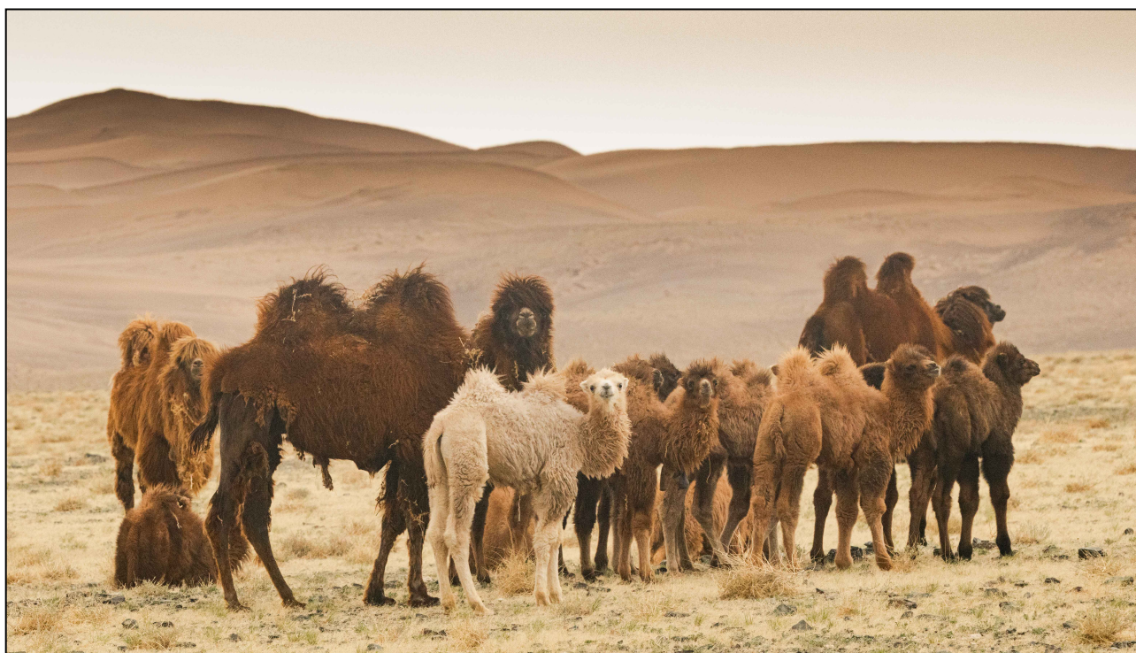
Domestic camels were an almost constant feature in Mongolia's otherwise ever-changing landscapes.

After lunch at a local restaurant, we stopped at a small rain-fed pond where we picked up several new species for the trip including Gray Heron , Common Shelduck , Northern Shoveler ,