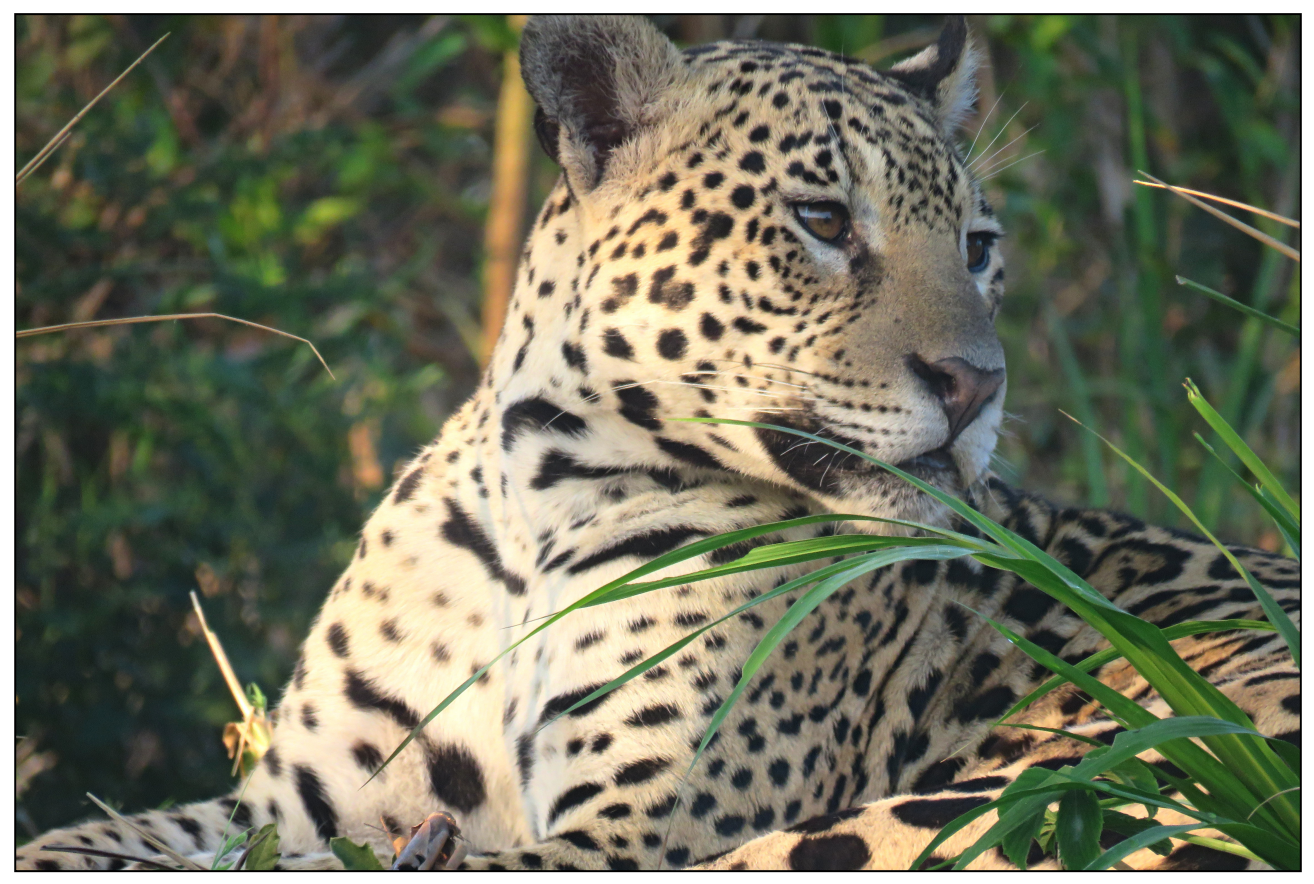
One of the eight Jaguars seen at the Pantanal

The Pantanal is the largest floodplain in the world, which extends across three countries: Bolivia, Paraguay and Brazil. In Brazil, the Pantanal covers about 37 million acres, which corresponds to only 2% of the Brazilian territory. This wetland is actually a kaleidoscope of different biomes that surround it, including the Cerrado. Perhaps more than half of the Pantanal is surrounded by this biome. To the northeast, the Cerrado mixes with splendid landscapes of the tablelands in the Chapada dos Guimarães National Park. On our 10-day tour we visited these two regions in the state of Mato Grosso. We recorded more than 250 birds and more than 10 species of mammals. Among the species that stand out, we can mention Hyacinth Macaw , Planalto Slaty-Antshrike , Jabiru , Mato Grosso Antbird , Helmeted Manakin , Jaguar , and Giant Anteater among many others.