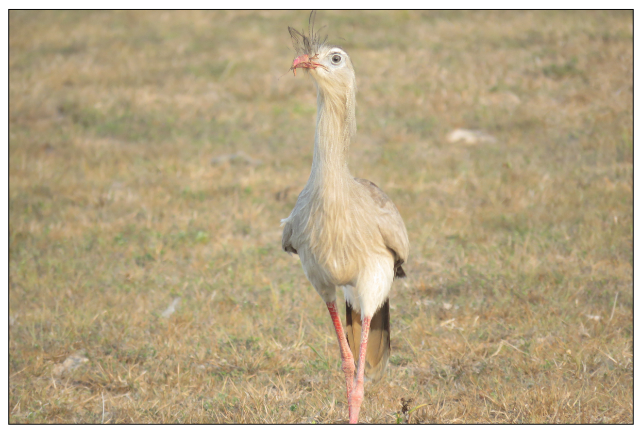
Red-legged Seriema at Pousada Piuval

Around noon we left for the city of Cuiabá to enjoy our last churrasco before taking our trip back to Sao Paulo and our homes, concluding our tour of the north of the Pantanal.