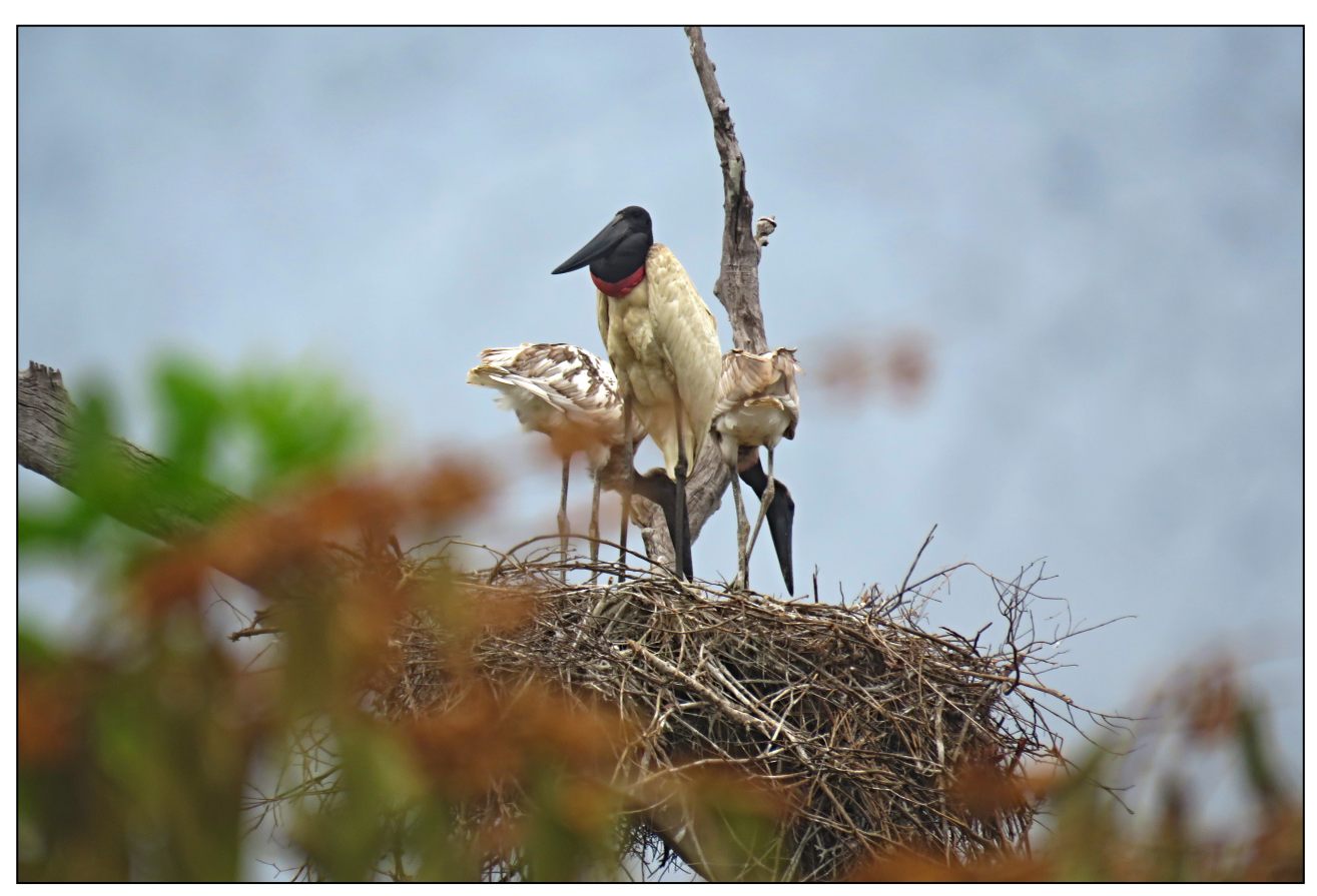
Jabiru - the iconic bird of the Pantanal

from our visit to this tributary was a family of Giant Otters . We got to their lair, but they didn't come out. Just when we were about to go back we started to hear them and saw them come out of the burrow. For several minutes, which seemed like hours, we accompanied the herd in their activities. Not bad at all! In one afternoon we had success with two of the South America Big Five!!!