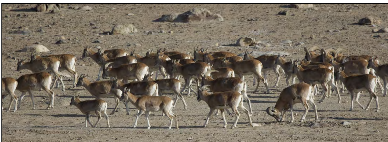
A herd of Ladakh Urials seen alongside the road on our way to Ullay Valley.

About an hour into our drive, the landscape began to change dramatically. Large boulders dotted the landscape around us, and snow-capped peaks rose up in the distance. We enjoyed the scenery so much, the drive went by quickly. We arrived at our homestay just in time for lunch and quickly settled in. It was quite a change from our camping experience, and we were very appreciative of having a common room with a wood-burning stove. As we enjoyed lunch, our