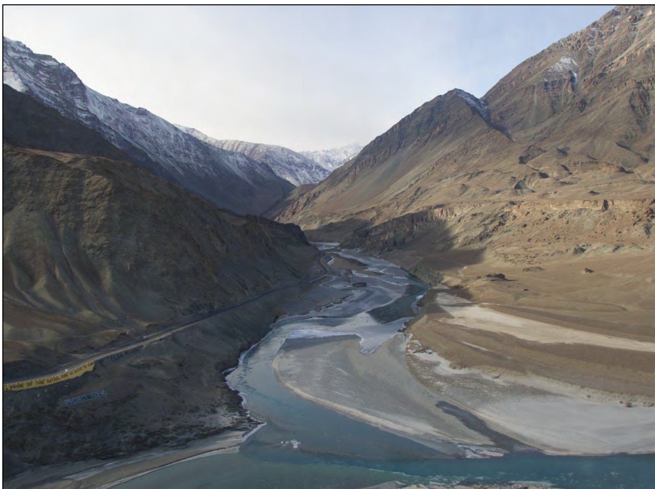
Lovely views of the Indus and Zaskar Rivers.

few moments to observe them and take some photographs. We then continued on our way. We also stopped at a beautiful scenic overlook where the Indus and Zaskar Rivers merge.