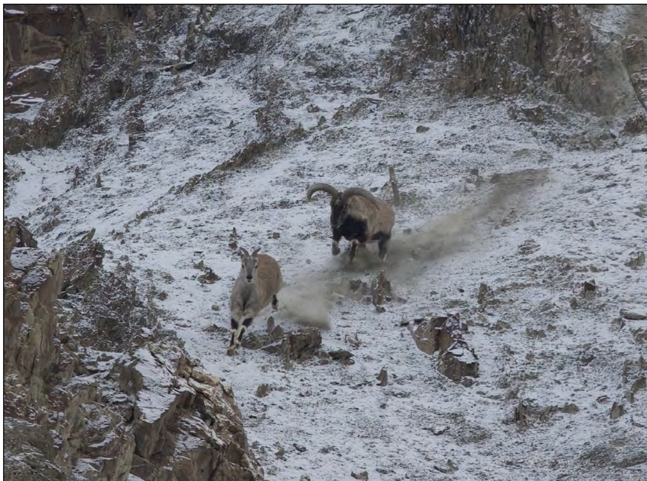
Watching courting Blue Sheep in action: one of the trip highlights.