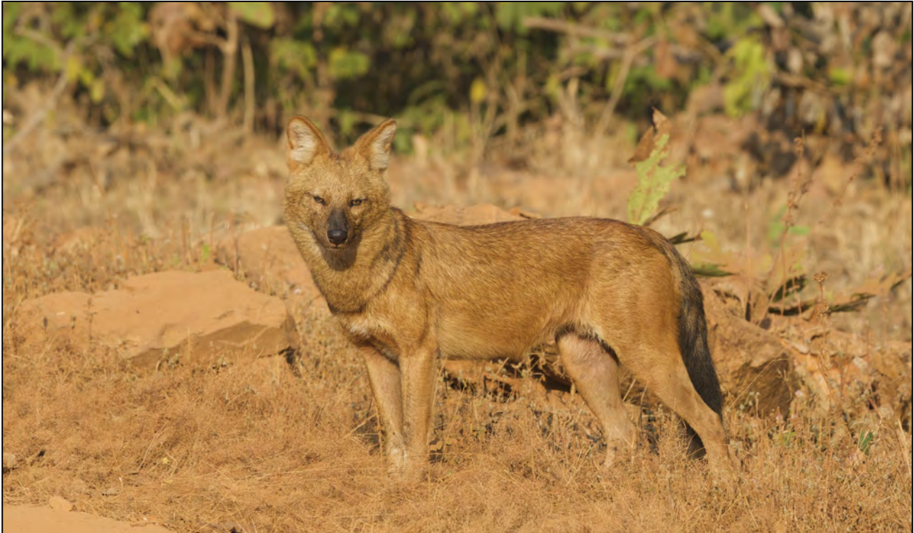
One of five Dhole (wild dogs) we observed in Tadoba National Park.

India is home to an extraordinary amount of biodiversity, and is just one of 17 countries categorized as “megadiverse.” It has a surprisingly high level of endemism, and is home to more than 7% of the world’s mammals, and 6.2% of the world’s reptiles, plus numerous amphibians, insects, and other invertebrates. Additionally, more than 1,000 bird species can be found in the myriad of habitats on the Indian Subcontinent. This 13-day birding and wildlife tour started in Tadoba National Park. Tadoba has one of the highest populations of Bengal Tigers in India. In four days, we were able to see four tigers, and some other wild felines such as Leopards and a Jungle Cat , as well as a Sloth Bear , and a many great birds including Crested Serpent-Eagle , Indian Scops-Owl , and Greater Racket-tailed Drongo . We then continued our journey to Leh, Ladakh, in the Himalayas, in the northern Indian state of Jammu and Kashmir. Known as “Little Tibet,” the region is steeped in Buddhist culture. Leh is also the gateway to Hemis National Park - home to a number of wildlife species. One of the most sought after of these, of course, is the Snow Leopard. On this trip, we were extremely lucky. We saw not just one, but four Snow Leopards , as well as some sought after birds such as Wallcreeper , Ibisbill , White-browed Tit-Warbler , and Tibetan Partridge . In total, we observed 19 mammal species, two reptile species, and 88 bird species on this tour.