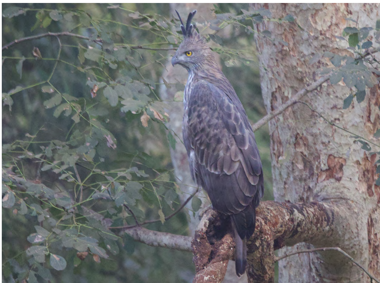
A beautiful Changeable Hawk-Eagle showing off its impressive crest.