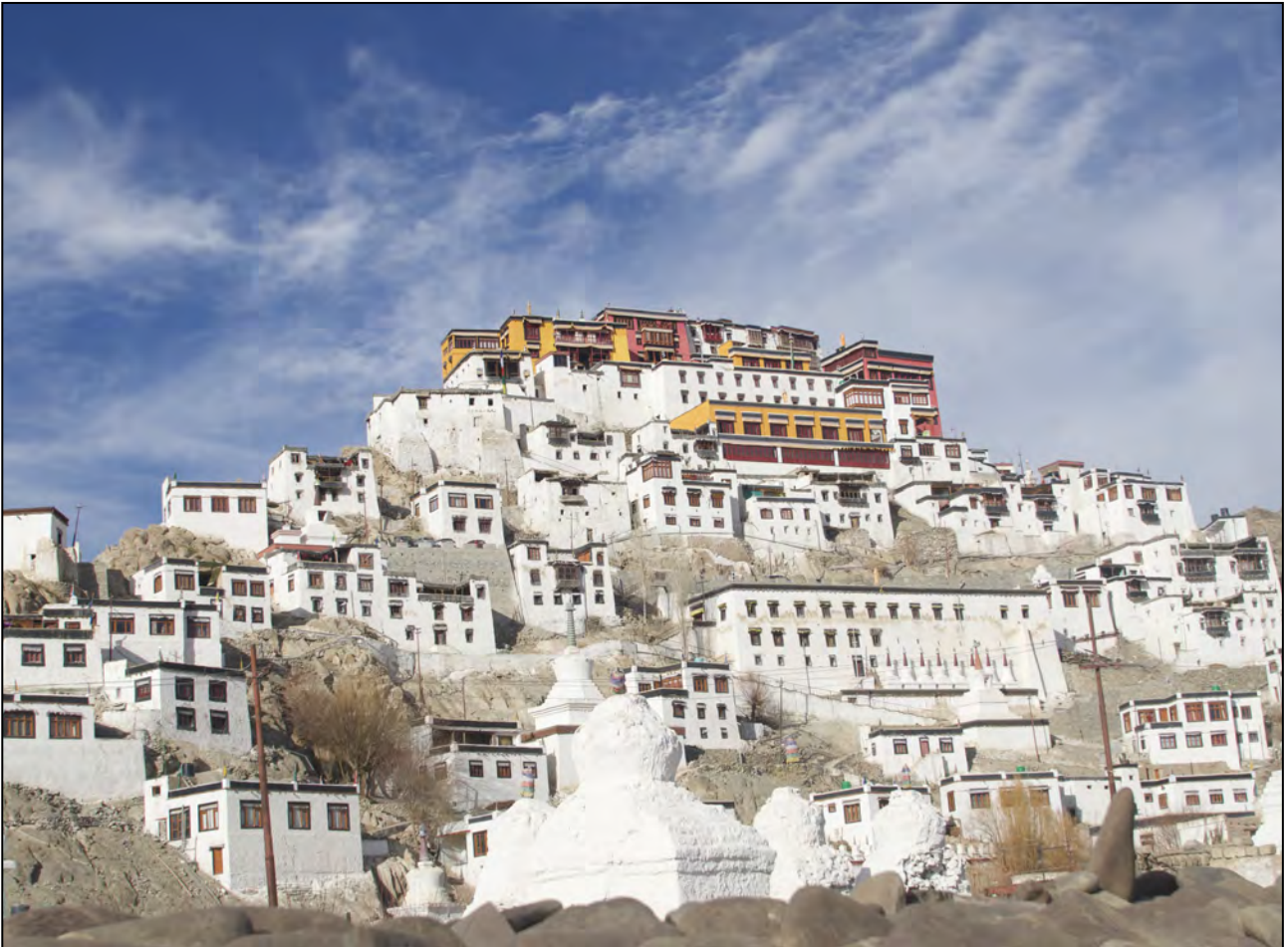
A view of Thikse Monastery.

After packing up, we said our goodbyes to our homestay hosts and our support team and returned to Leh. We made a stop at the Thikse Monastery - a Tibetan-style Monastery located on the top of a small hill. We spent about half an hour viewing the beautiful art, stupas, and wall paintings. In the center of Maitreya Temple, there is a two story tall Buddha. We then returned to our hotel in Leh for dinner and a relaxing evening.