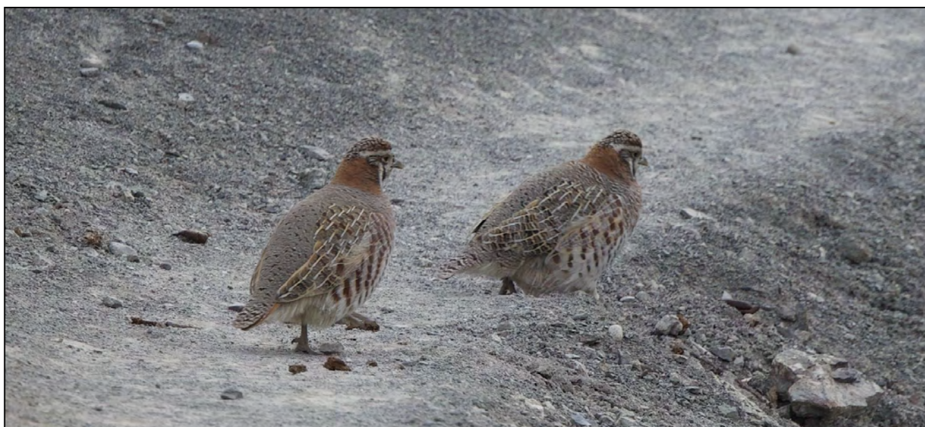
Tibetan Partridge in Rumbak.

The following morning, we woke up to a surprise - snow! And much colder temperatures, probably around -20 C. After a great breakfast and some scanning of the surrounding mountains, we geared up for a walk along the river bed. As we walked, it continued to snow, covering the entire valley in a light dusting, turning everything white. We walked for about two and a half hours, passing prayer flags and stupas, and some stunning scenery. As we walked, we spotted a small herd of Blue Sheep running down a rocky slope. We had the opportunity to watch them for several minutes as they ran part way down the mountain. December is breeding season for Blue Sheep and we had the opportunity to observe some courtship behavior. Further up the riverbed, we spotted a new mammal for the trip - Royle's Pika scurrying among the rocks.