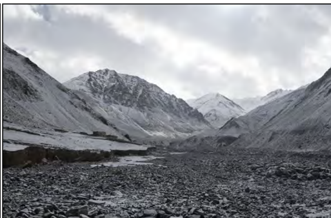
Our first morning in Rumbak Valley, we woke up to a snow-covered landscape.

The next morning we, we woke to see the nearly full moon hovering just above the mountains. It was beautiful. Around breakfast time, our guides heard word that a snow leopard had killed three domestic goats near the town of Matho. Though we didn't have all of the details we decided it was worth a visit to the area, in case the cat was still hanging around. On our way, we spotted a small herd of Ladakh Urials far above us. We stopped for a few photos before continuing on our way. After we arrived at the site of the kill (the owners of the goats had already removed the carcasses), we spent some time scanning the hillside, but didn't see anything. Around lunch time, we slowly made our way back to Leh. As we did, we picked up some new bird species for our trip including Black-throated Thrush and at our lunch stop, three Ibisbills (one juvenile and two adults) - lifers for the entire group. We also saw a number of the lovely White-winged Redstarts in the bushes along the river. Back in Leh, a few of us walked to check out the local market, where we spotted an Eurasian Sparrowhawk flying overhead, before having dinner and enjoying a comfortable evening at our hotel.