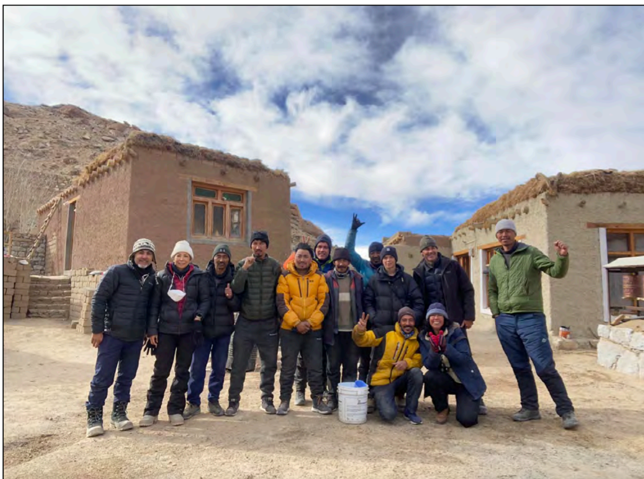
The entire team on our final morning in Ulley Valley, soon after seeing one last snow leopard of the trip!

On our last morning, we were having breakfast when one of the local assistants walked in and simply said “ snow leopard. ” We quickly gathered cameras and coats and ran to the roof of the homestay, where our local trackers had been scanning for cats all morning. Though this individual was far off, we all got to see one more of these elusive cats walking among the rocks close to a mountain peak before it disappeared among the rocks. It was a great ending to our time in Ulley Valley!