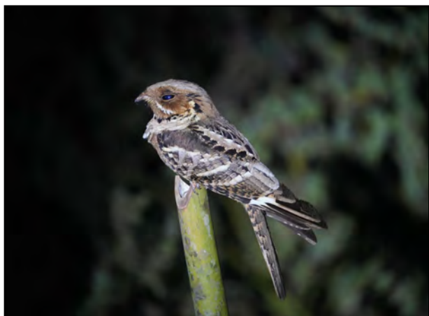
Some of the wildlife seen on our night safari: Bengal Tiger, Leopard, Jungle Cat and Jerdon's Nightjar.