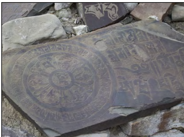
Stones carved with the mantra of compassion in Rumbak Village.

The next morning, we hiked to Rumbak Village. Today, we enjoyed our first good sightings of Robin Accentors . We saw them all over the village, perched on roof tops and stacks of wood. We also had our first sighting of a Hill Pigeon perched on a window ledge. After our walk, we stopped at a local house where we enjoyed a cup of chai tea and had the opportunity to try butter tea - which is literally what it sounds like. Salty tea made with butter. As we walked back to camp, we stopped to photograph some of the beautiful homes in the village and the stupas, covered with dozens of stones which had been engraved with the mantra of compassion "om mani padme hum." We then returned to camp for a bit of rest during our final night of camping in the park. As evening was setting in, Gyaltson called us up to the viewing point. We arrived just in time to see a Northern Goshawk perched for a few moments before taking off in a high speed chase of another bird - likely a Tibetan Partridge.