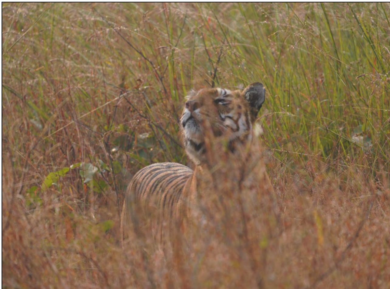
Our very first looks at a Bengal Tiger coming toward us.