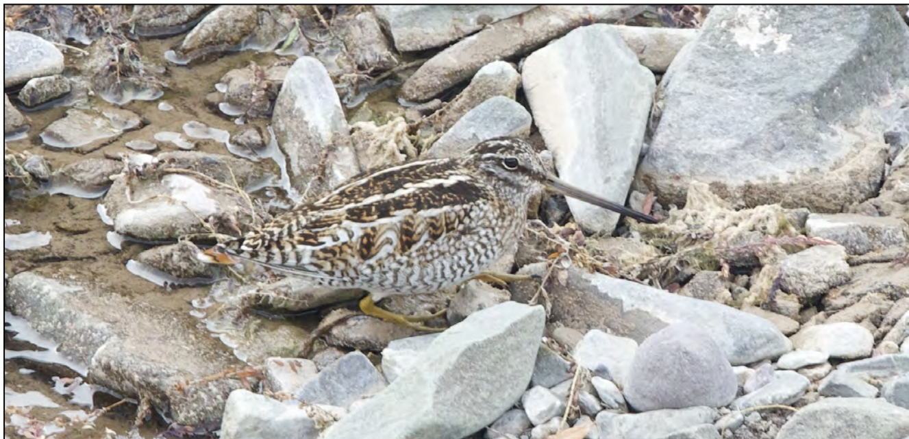
Common Snipe in Rumbak.