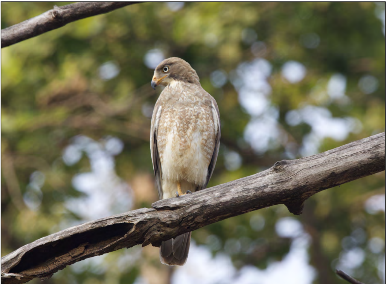
One of several White-eyed Buzzards seen on our trip.

Tadoba National Park encompasses approximately 600 km 2 of mostly southern tropical dry deciduous forests. Teak and Crocodile Bark are some of the prominent tree species found here. As soon as we entered the park, we observed a few Wild Boars foraging in the open fields, as well as a small herd of the beautiful Spotted Deer . We also observed some of the more common bird species we would see throughout much of the tour including Asian Green Bee-eater , White-throated Kingfisher , Red-vented Bulbul , and the ubiquitous and aptly named Jungle Babbler . We also got a fabulous look at a White-eyed Buzzard perched on a dead snag against a bright blue sky.