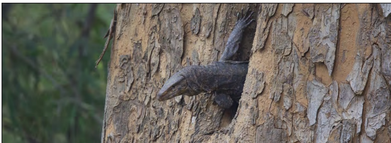
Bengal Monitor photographed in Tadoba National Park.