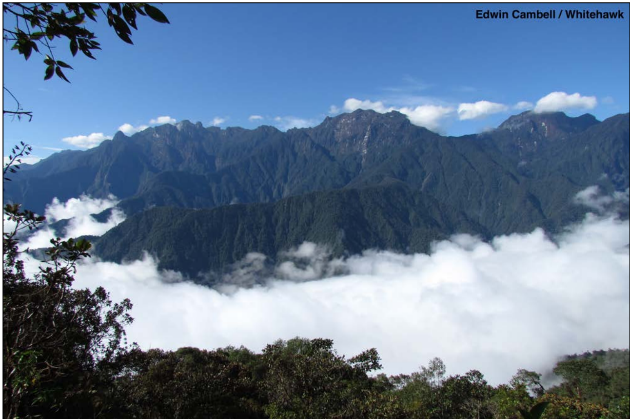
Tatama NP from Montezuma Mountain

We had an early start this morning. By five a.m. we were already piled into our Toyota, headed to the top of the Montezuma Mountain. After an hour along the bumpy road, we reached the peak just in time for sunrise. Our first target was observed almost immediately upon exiting the vehicle. What a surprise! The endemic Chestnut-bellied Flowerpiercer was at a feeder installed up there. We continued our journey down the hill, spotting a group of the near-endemic Beautiful Jay that were moving fast into the forest. We did not get a good view of the birds at this time, but later we had another encounter with great views. After a while, we stopped for breakfast and were delighted with the busy Tourmaline Sunangel , Green-crowned Brilliant and Rufous-gaped Hillstar , among other hummingbirds. We didn't have to wait long for another endemic to make its presence known. The Munchique Wood-Wren sang along the roadside and then appeared several times for clear views. As we continued on our way, we saw several other specialties such as Black Solitaire , Club-winged Manakin , Brown Inca , Fulvous-dotted Treerunner and Purplish-mantled Tanager – all regional endemics of Colombia and Ecuador. Another Colombian endemic that should be mentioned is the Golden-ringed Tanager – La Bangsia del Tatama .