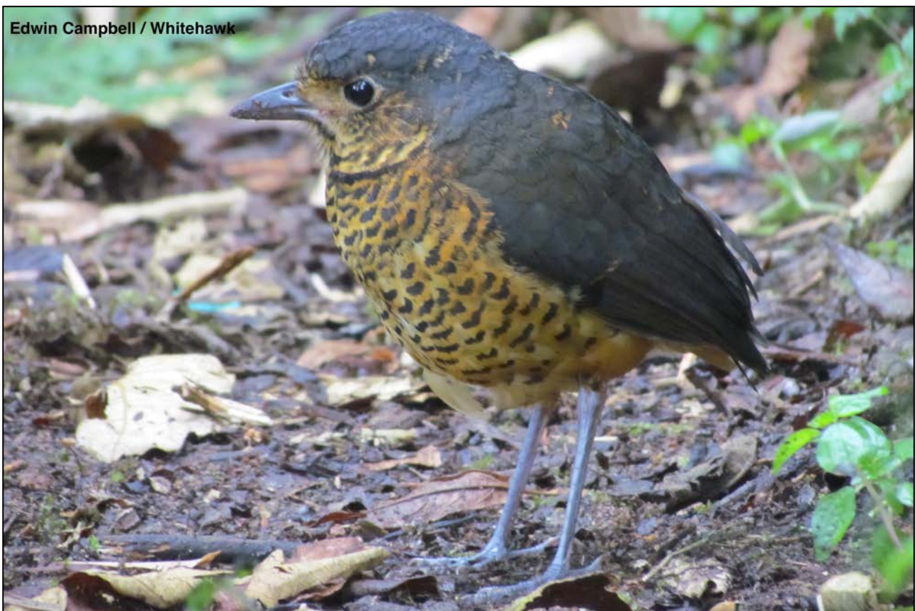
Edwin Campbell / Whitehawk