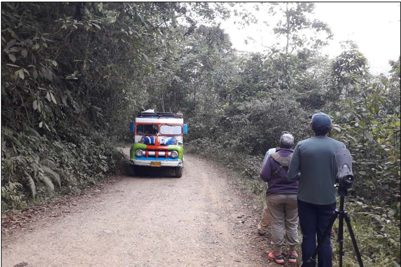
Birding at Chicoral

After a few hours and a delicious lunch, we traveled on to our lodge, making several stops along the way. These birding stops produced some great birds like Crimson-rumped Toucanet , Collared Trogon , Yellow-vented Woodpecker and Blue-naped Chlorophonia . Despite having started late, our day was very productive, with over 80 species seen.