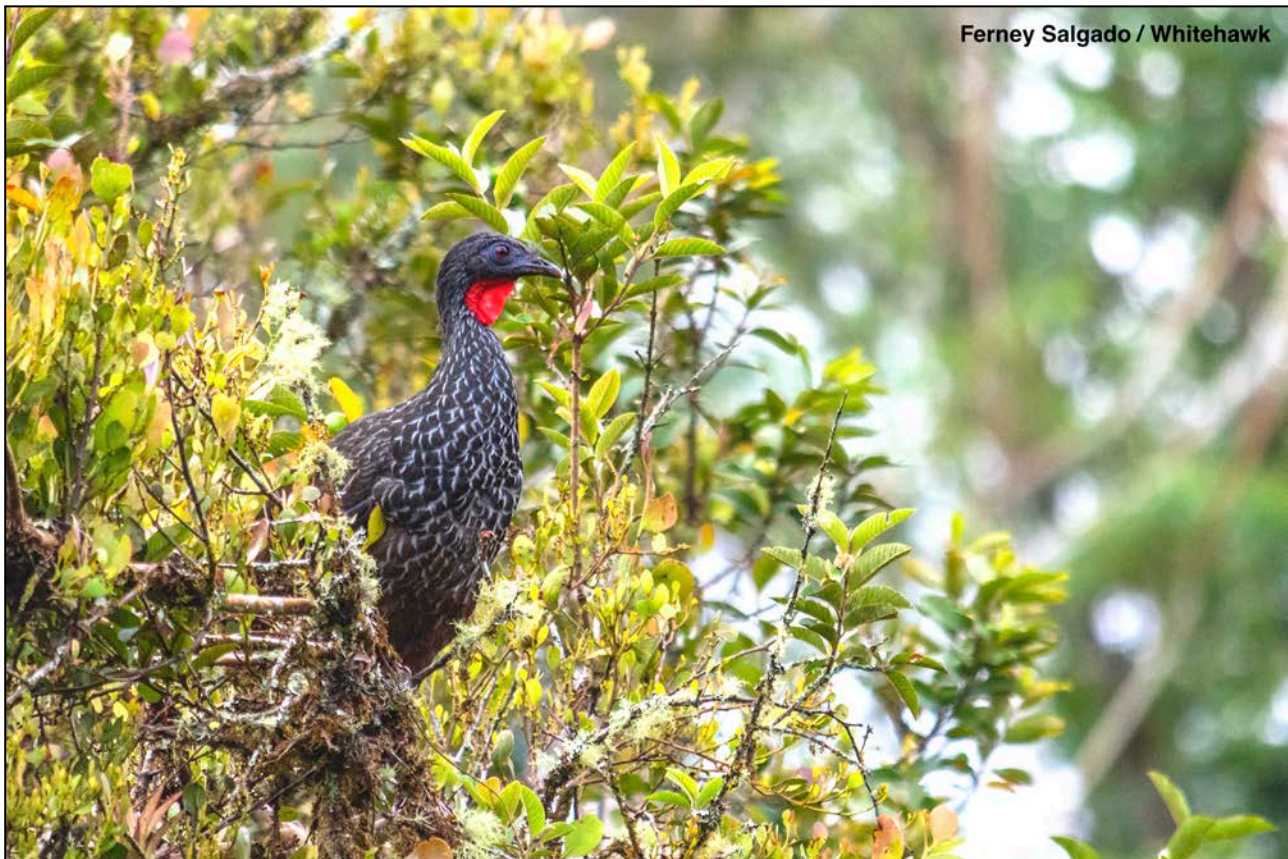
Cauca Guan, a Colombian endemic bird spotted at Otun Quimbaya

managed to get one of the specialties of Otun Quimbaya, the endemic Cauca Guan . When arriving at our lodge another specialty showed up – Red-ruffed Fruitcrow .