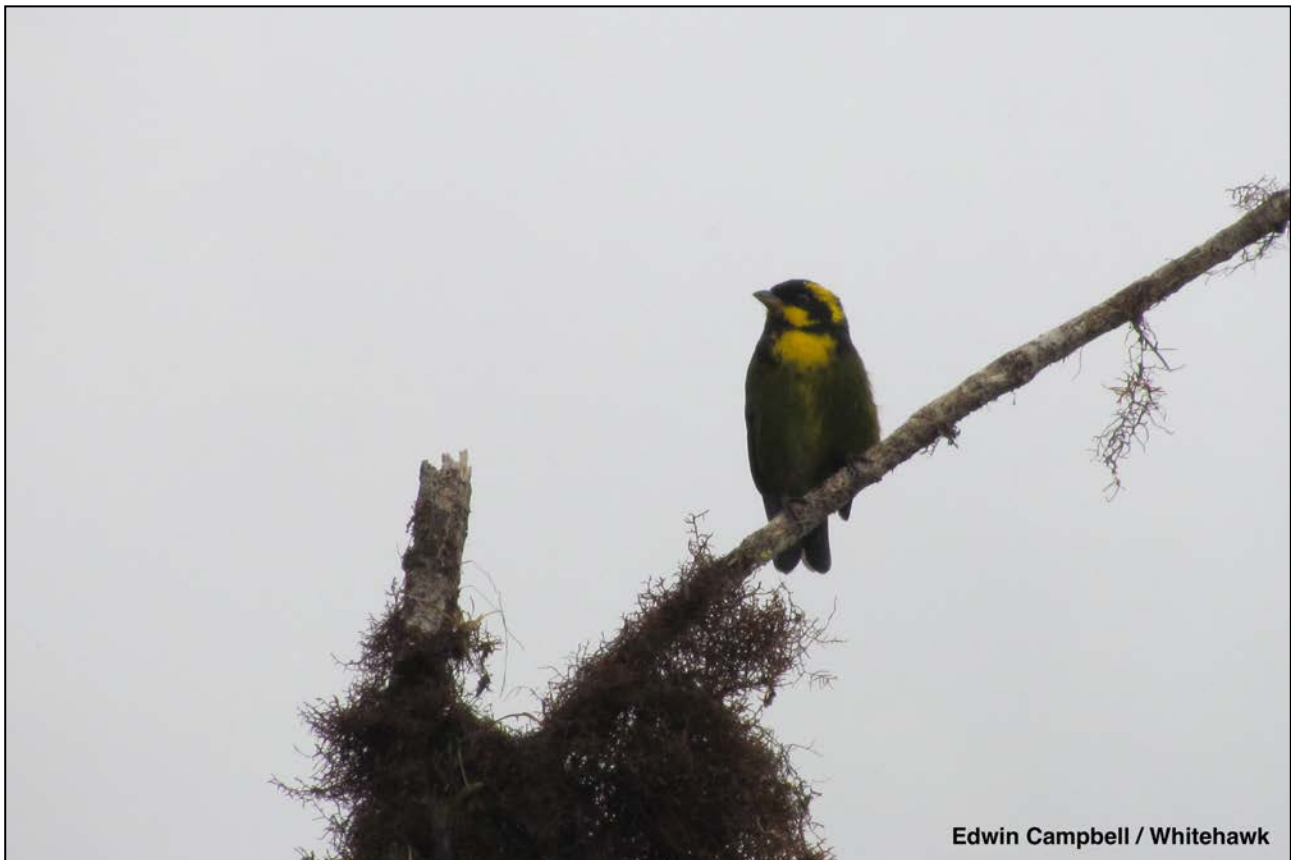
Gold-ringed Tanager - endemic bird of Tamama NP (Montezuma Mountain)