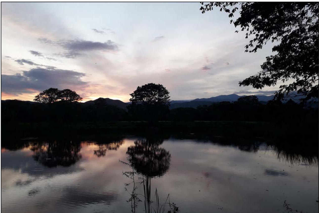
Sonso Lagoon at sunset. Buga, Colombia