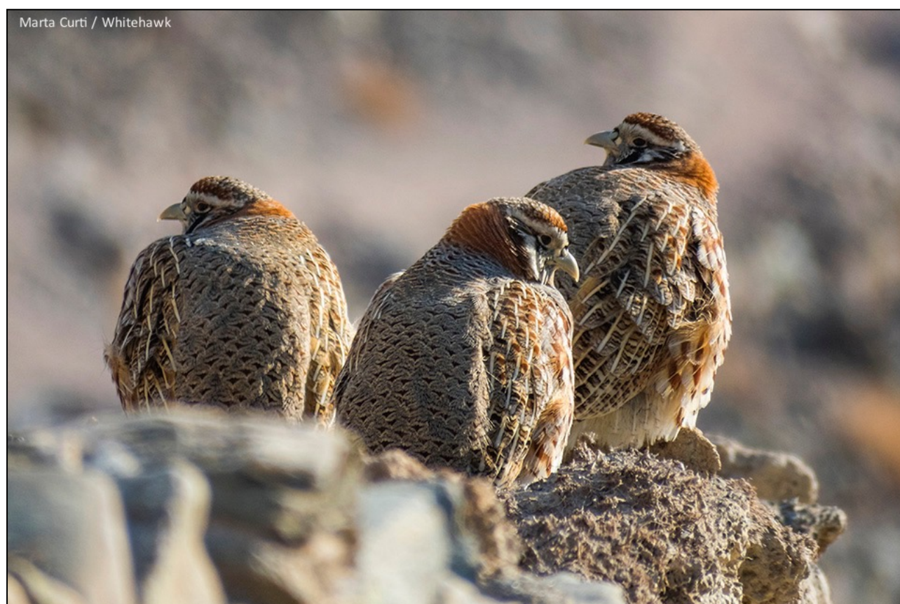
Tibetan Partidges in Yurutse Valley