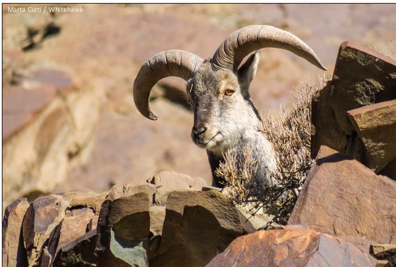
Male Blue Sheep watching us as we watch him