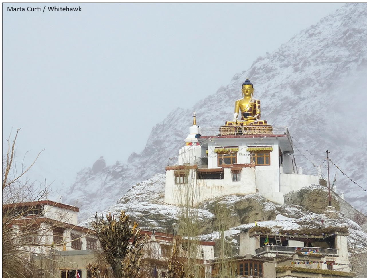
The monastery from where we scanned for wildlife in Hemis Sukpachen

We ended up spending an unplanned night in Delhi. Taking advantage of the situation, we headed out into the city to enjoy the Red Fort and see the market place - which gives a whole new meaning to the term "hustle and bustle." Car horns blaring, bicycles and rickshaws passing within inches of us, people shouting about their wares, aromas from the different food carts mingling with aromas from less pleasant sources, all combined to give us an amazing experience of Delhi's old