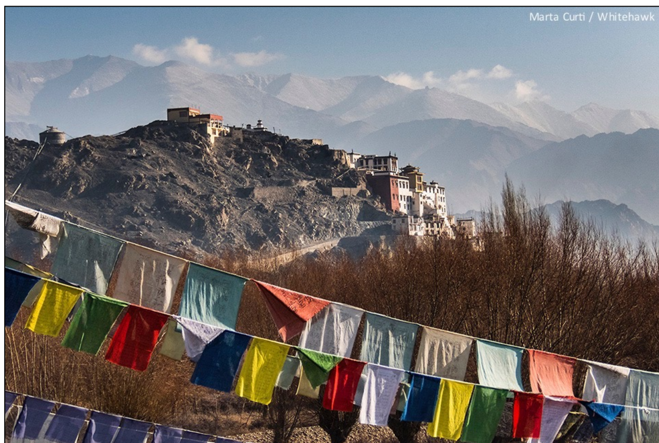
Monasteries, mountains and prayer flags as seen from the Indus River