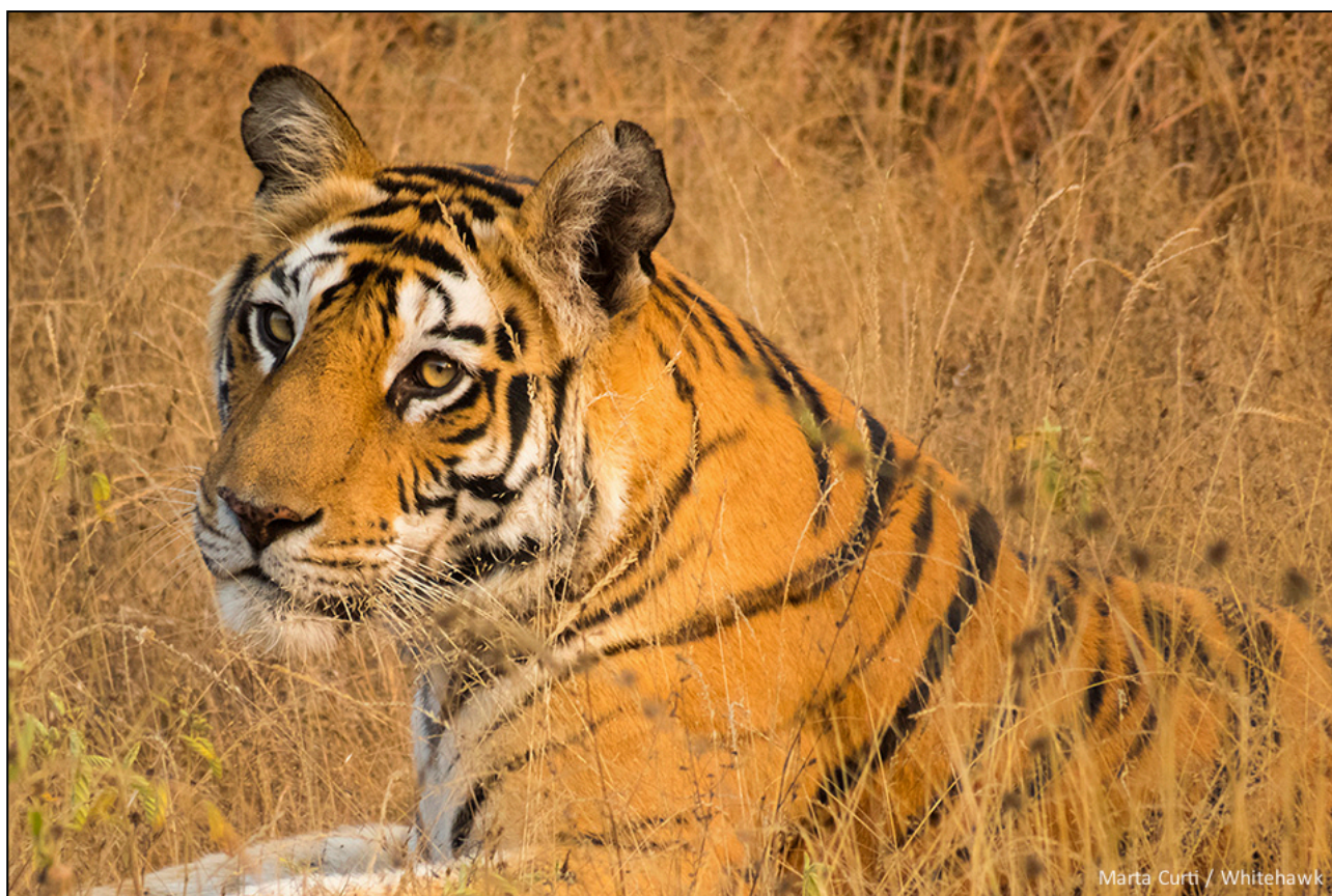
Female Bengal Tiger, Bandhavgarh National Park, India

We wake up early and head to the Delhi airport to catch our 8:30 a.m. flight to Jabalpur. We are anxious about the flight, as due to delays, we would already miss our morning safari. We have to make it to the park gate by 4 p.m. or we won't make the afternoon safari either. We have consolidated all of our luggage into carry-ons, so we don't need to wait for luggage. After disembarking from the plane we immediately go outside and find our driver waiting for us. He informs us that the main road is closed (of course!) because some VIPS have also arrived on the same flight. I tell him we hope to make the afternoon safari, if at all possible. Thanks to him and his fast, skilled driving, we make it with time to spare. And it was very lucky, too. That evening, we are able to get very nice views of an adult female Bengal Tiger sitting in the grass! We also see two other mammals: Spotted Deer and Sambar Deer , as well as a number of beautiful birds including great looks at Crested Serpent Eagle and Indian Roller .