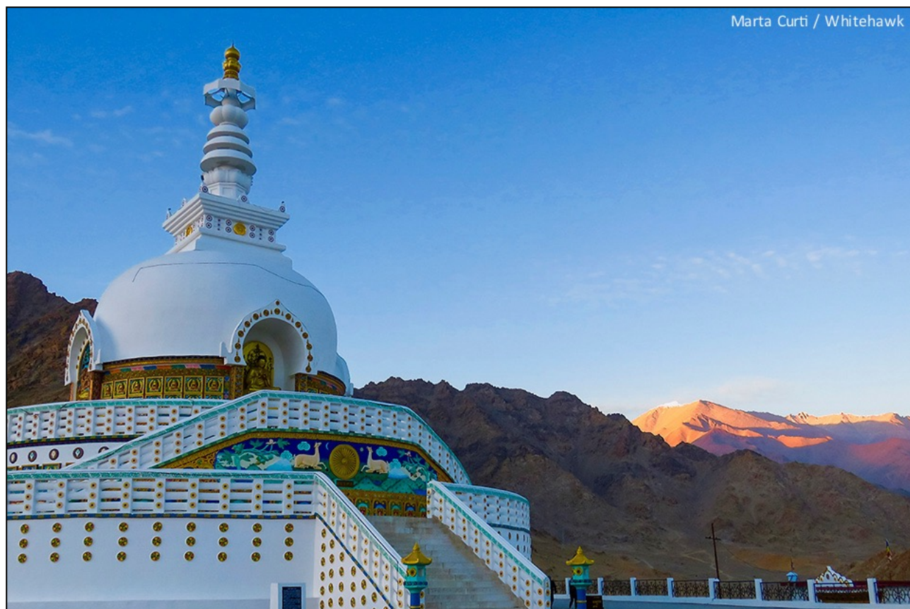
Shanti (Peace) Stupa, in Leh, Ladakh.

yet we manage to spot a pair of Common Mergansers swimming in the cold water and at least 5 White-winged Redstarts are flitting about in the bushes. After about 20 minutes or so, we continue our journey. We drive for another hour out of Leh over beautiful bridges and around winding roads - the blue-tinged Indus River flowing beneath the steep drop-offs and sharp curves of the very narrow highway leading in to the park. On route, our guide, Stanzin, spots a herd of Ladakh Urials grazing not far from the road.