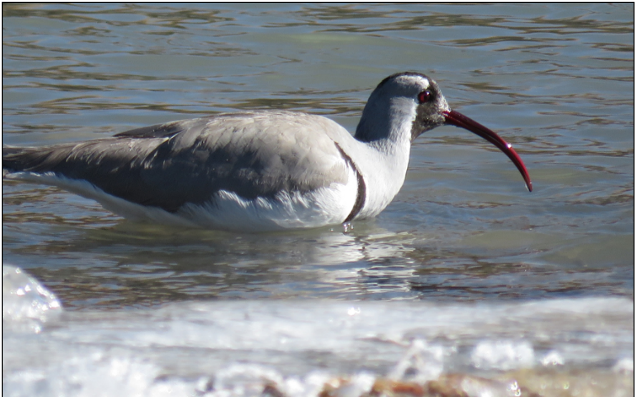
Ibisbill, observed foraging in the Indus River.

We then head to Shey Marsh for birding around some open grassy areas and ponds. Just below the Shey Palace, we see a Eurasian Curlew walking in the grass. We also spot Indian Pond Heron , Black-throated Thrush and Blue Whistling Thrush , among other species.