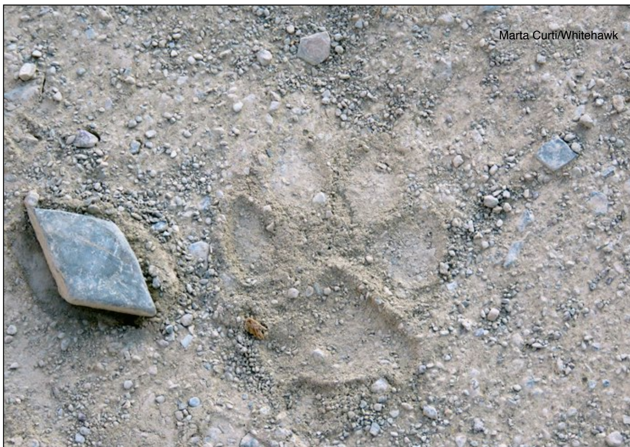
One of the many wolf tracks we spotted on our hike

it soon grows tired, or simply decides the magpies aren't worth the trouble, and it walks back up the mountain and goes to sleep on a ledge, out of our view.