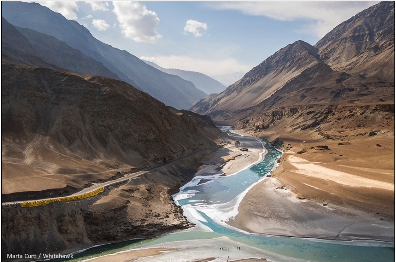
The confluence of the Indus and Zaskar Rivers