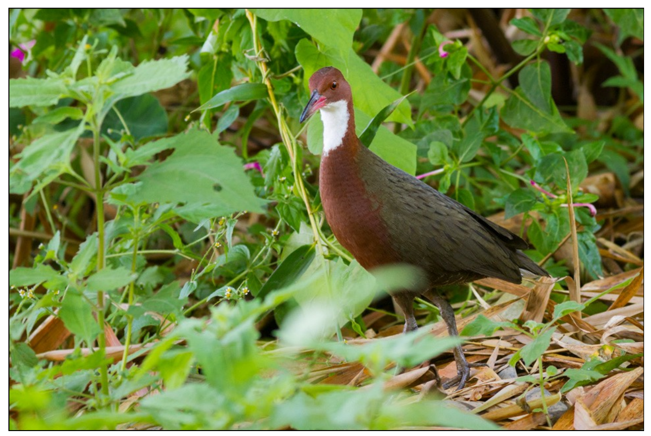
White-throated Rail was a challenge but finally was seen well at Lac Alarobia

Upon our arrival to the airport we took a short walk around the air strip and got to see three new endemic species: Madagascar Lark , Madagascar Cisticola and Madagascar Munia . Once in the capital, and after a short break, we went back to Lac Alarobia for an afternoon walk. It ended up being a great decision to repeat this location, as we got to see the White-throated Rail which we had only heard during our first visit. We also got fantastic views of a Baillon's Crake feeding next to a Madagascar Swamp Warbler and three Huntington Teal . We also got the only Red-knobbed Coot of the trip.