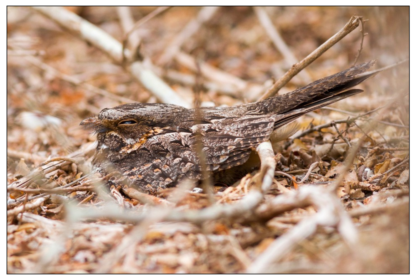
The Madagascar Nightjar is common throughout but seeing it roosting during the day is not so easy

In the afternoon, and after an unsuccessful short drive looking for the Madagascar Sandgrouse , we took another hike, this time in the Spiny Forest. We didn't find as many birds in this challenging but admittedly unique habitat, however, we added Subdesert Brush-Warbler to our list and had again phenomenal views of Madagascar Nightjar and Torotoroka Scops-Owl . During our night hike in the Gallery Forest, we spent a good time watching Gray Mouse Lemur and even saw a sleeping Frances's Goshawk .