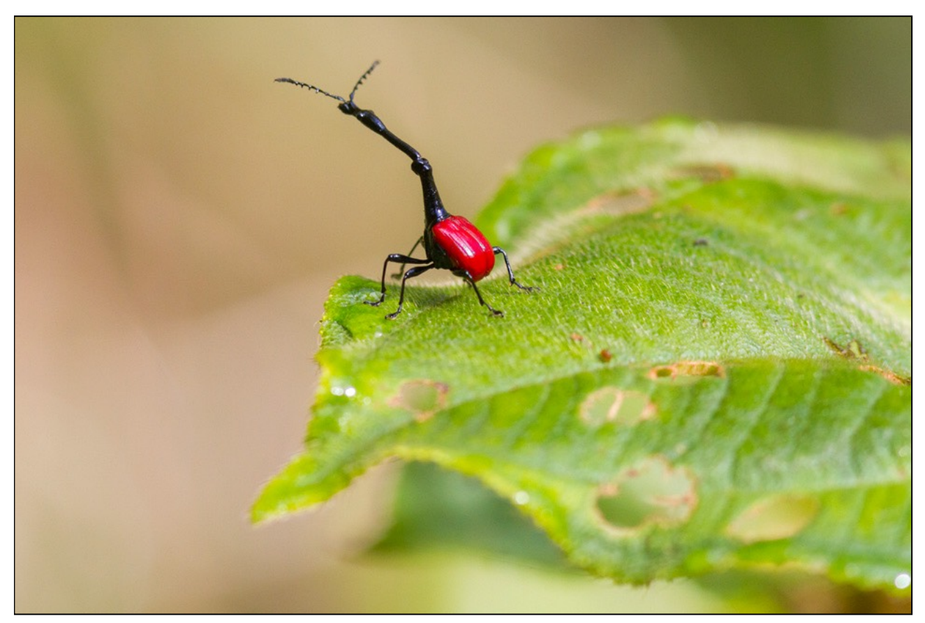
The amazing-looking Giraffe Weevil at the laroka Forest