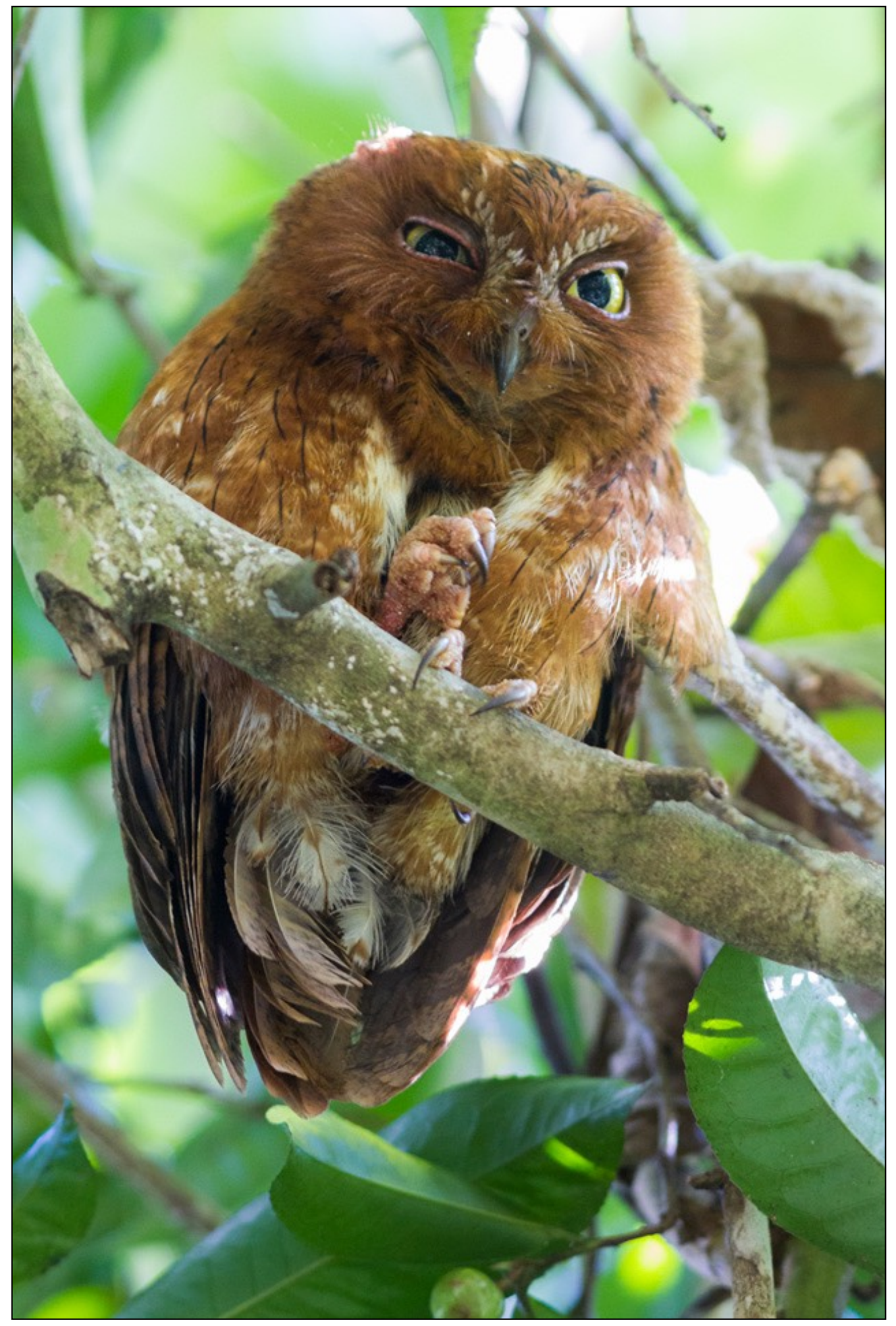
Malagasy Scops-Owl at Andasibe NP