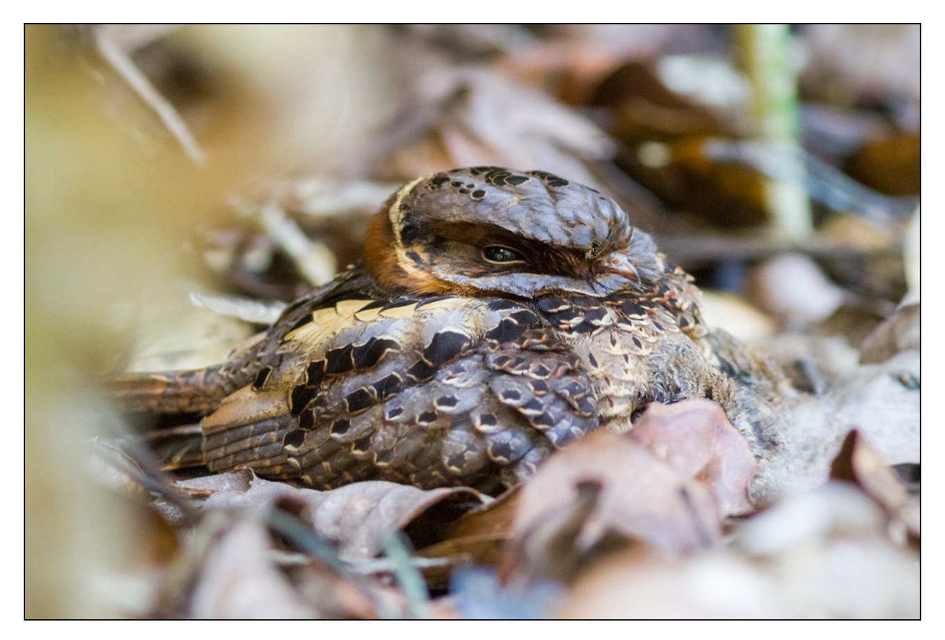
Collared Nightjar, a true gem of the Madagascar forests

After this short and intensive afternoon we went back to the hotel for dinner but returned to the road next to the park for a night walk. This was again an excellent opportunity to see mammals and reptiles, like the Goodman's Mouse Lemur and the Furry-eared Mouse Lemur .