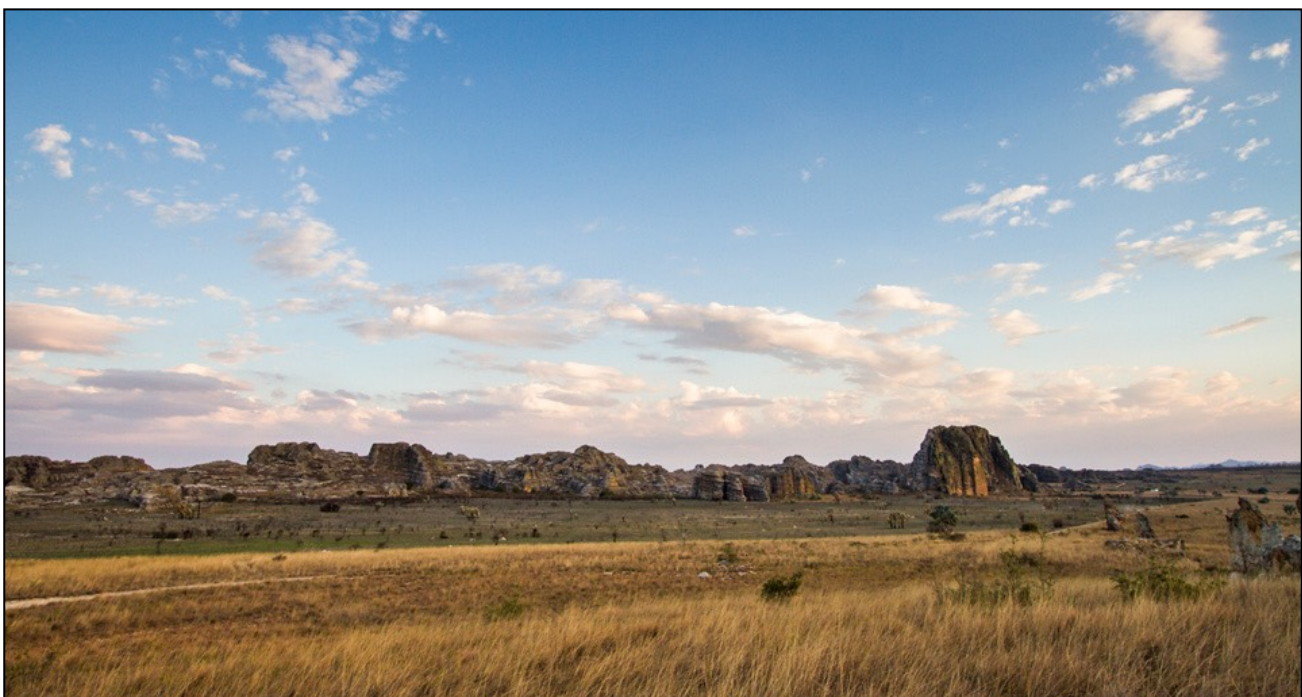
The open grassland around rocky outcrops of Isalo makes for a spectacular landscape