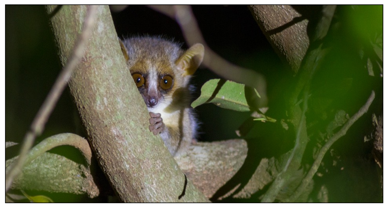
Gray Mouse Lemur during the second night hike at Berenty Reserve