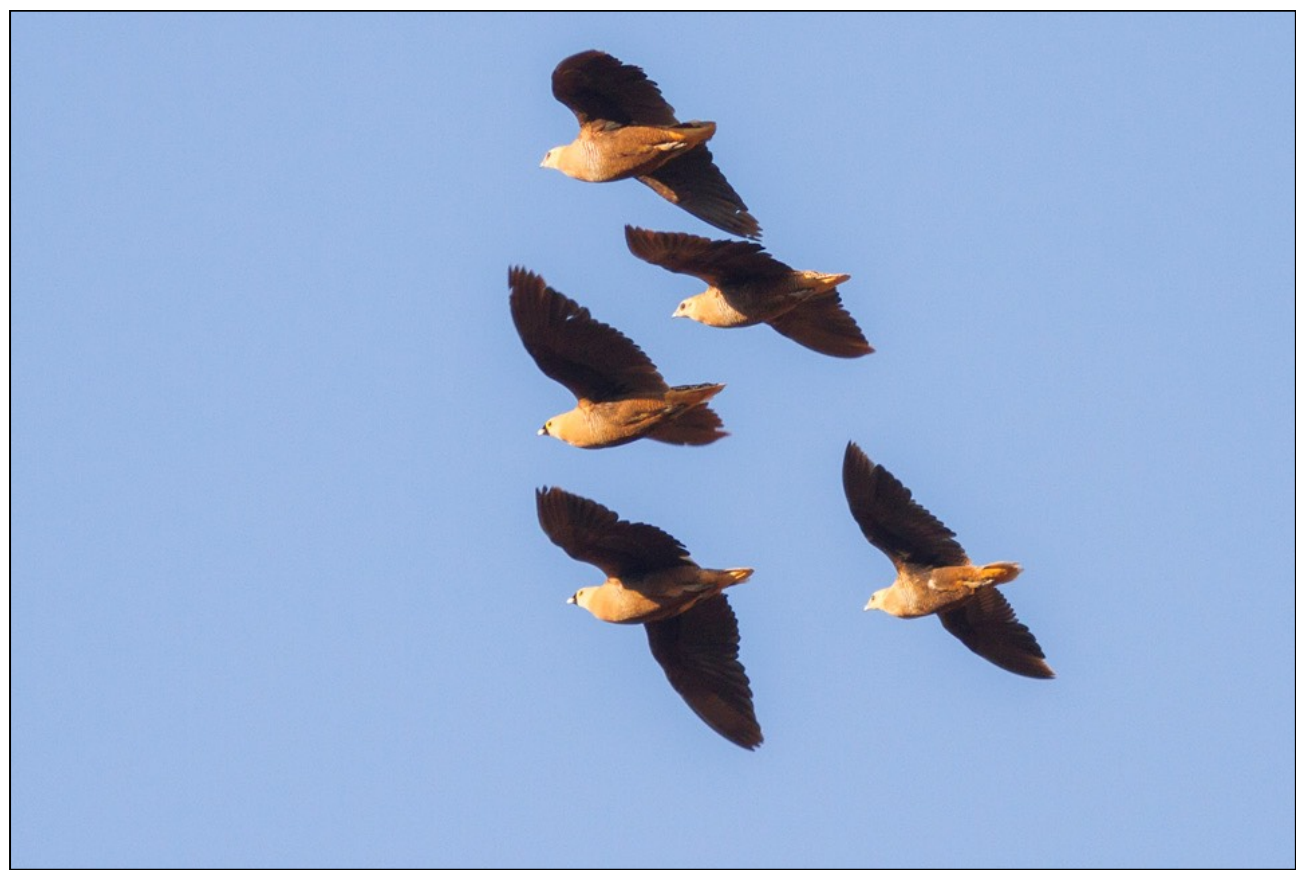
Madagascar Sandgrouse flying over, on the road to Isalo

The drive was uneventful. There were very few cars on the road and the asphalt was in good condition for the most part (a nice change!). Our first stop was at a dry river bed in order to see the Sandgrouse. We ended up seeing 15 of them in flight and a couple sitting on the ground, which allowed for scope views, and one pair of Madagascar Buzzard .