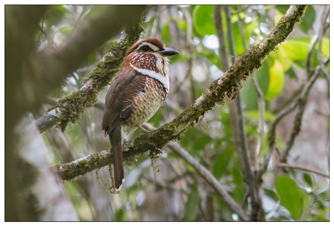
Short-legged Ground-Roller at laroka Forest - We had to work a little bit for this one!

We left early and drove over an hour by 4WD until we got to the trailhead. On the way to the nesting site we tried to see several of the endemics we needed, starting with one right were we left the cars: Rand's Tetraka . Shortly after we started to walk we heard another target, the Crossley's Vanga , which we saw well shortly afterwards. A surprisingly well seen Henst's Goshawk was perched nearby and sat just long enough for us to see it before it flew off. We were on a roll! We got deeper into the forest and started looking for another main target: the Rufous-headed Ground-Roller . It took some time and patience, and it was certainly dark and difficult to see among the vegetation, but everyone got a view of this lovely bird. For our next target along this trail, we went down a slope and up a stream to search for the Short-legged Ground-Roller , and there it was, calling from a high perch in all its glory. This was another highlight of the morning!