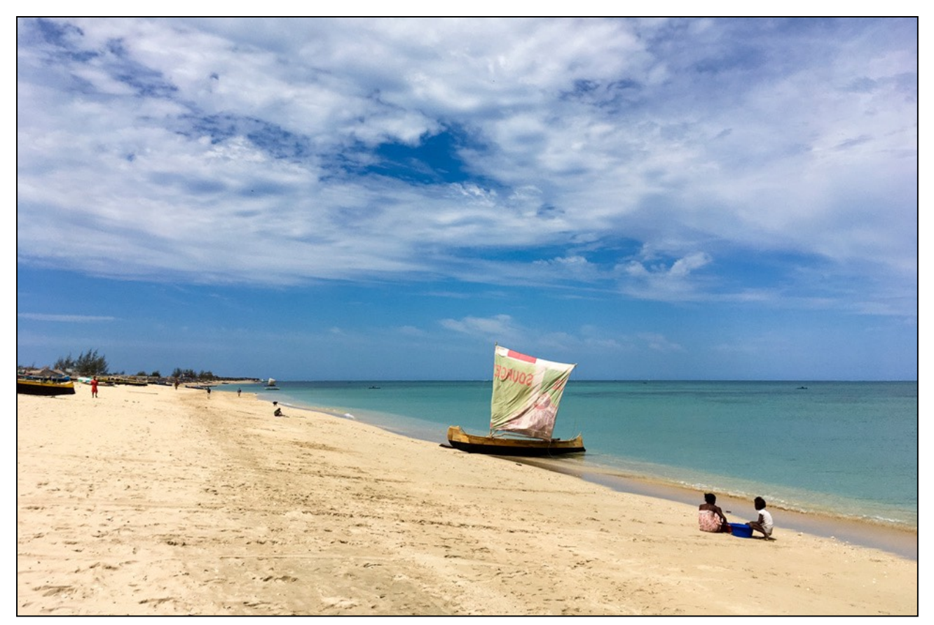
The coast in front of Nosy Ve Island, nothing but paradise

Once in town we used three ox-carts to reach our fast boat to <u>Nosy Ve</u>. It was certainly an experience! The boat trip was uneventful, with a short stop to check out a Humblot's Heron nest on some sea cliffs, where a a single fledgling remained. Once near the island the first terns were seen: Lesser and Great Crested Terns and a single Saunder's Tern . Some shorebirds were seen on a sand bar: Crab Plover , Sanderling and Greater Sand-Plover . However, the real spectacle was yet to come. Before we could step foot on the island we saw our first Red-tailed Tropicbirds , which are obviously not endemic but a really nice bird to see. We paid a short visit to the colony, which had almost fully-grown chicks and adults on eggs too. Some birds flying overhead provided some good photography opportunities. After the walk, part of the group went for a short snorkeling session, while others explored another part of the island. We then headed to the mainland, in order to have lunch, where a confident Littoral Rock-Thrush made an appearance. After lunch we took the boat ride back to Tuléar before the wind started to pick up.