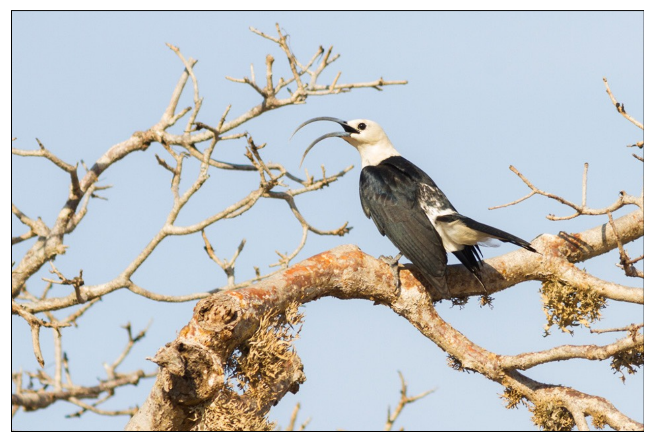
Sickle-billed Vanga at Reniala Private Reserve - what a bird!