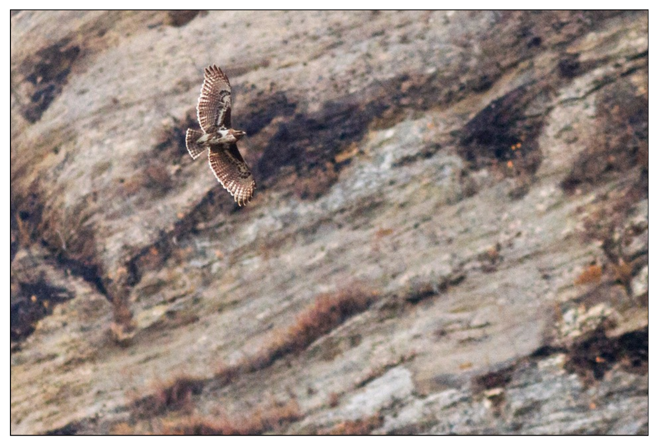
Madagascar Buzzard at Isalo National Park

was heartbreaking. We kept going nevertheless, and along a trail, while looking for the Madagascar Buttonquail , we had excellent views of a Madagascar Hoopoe feeding a juvenile, Madagascar Bee-eaters , and the best views of Madagascar Paradise-Flycatcher , which were quite cooperative for pictures. We didn't get the Buttonquail, but on our way out we saw a couple of Madagascar Partridge climbing a slope! Our last stop was at Sunset Window, where we got two more partridges, along with Madagascar Swift .