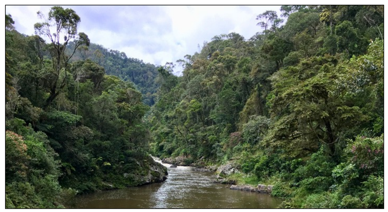
Ranomafana NP holds some of the most impressive patches of rainforest in Madagascar