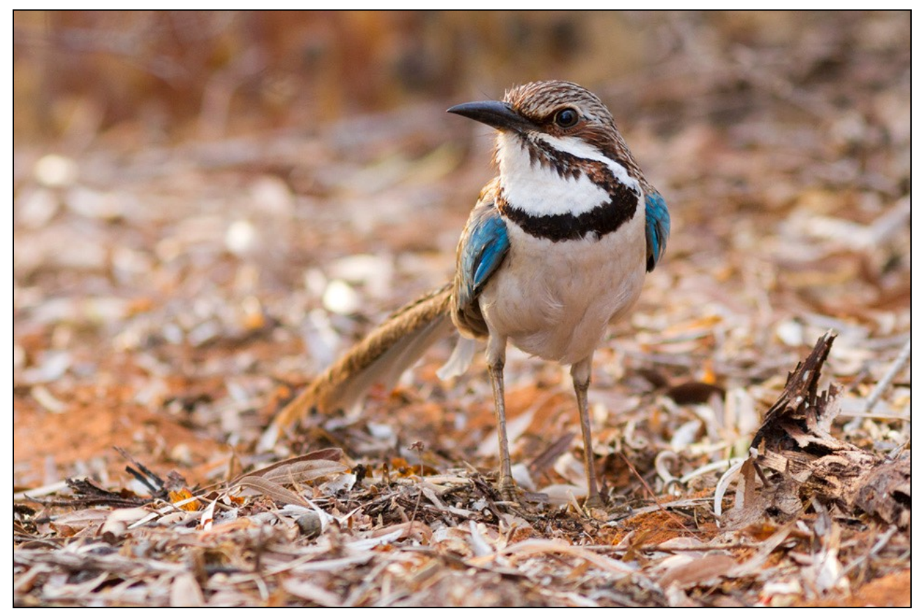
One of the tour favorites - the Long-tailed Ground-Roller

The day started at <u>Reniala Private Reserve</u>, which consists mainly of Spiny Forest and is owned and managed by a local family. We had several main targets in mind, including the Subdesert Mesite and the Long-tailed Ground-Roller . With the help of Musa's son and local guide Freddy, we searched first for the Ground-Roller, before the day started to warm up. It took as a while, and some fast walking, but the local guides were extremely good at locating the bird - which is extremely beautiful and way worth the effort.