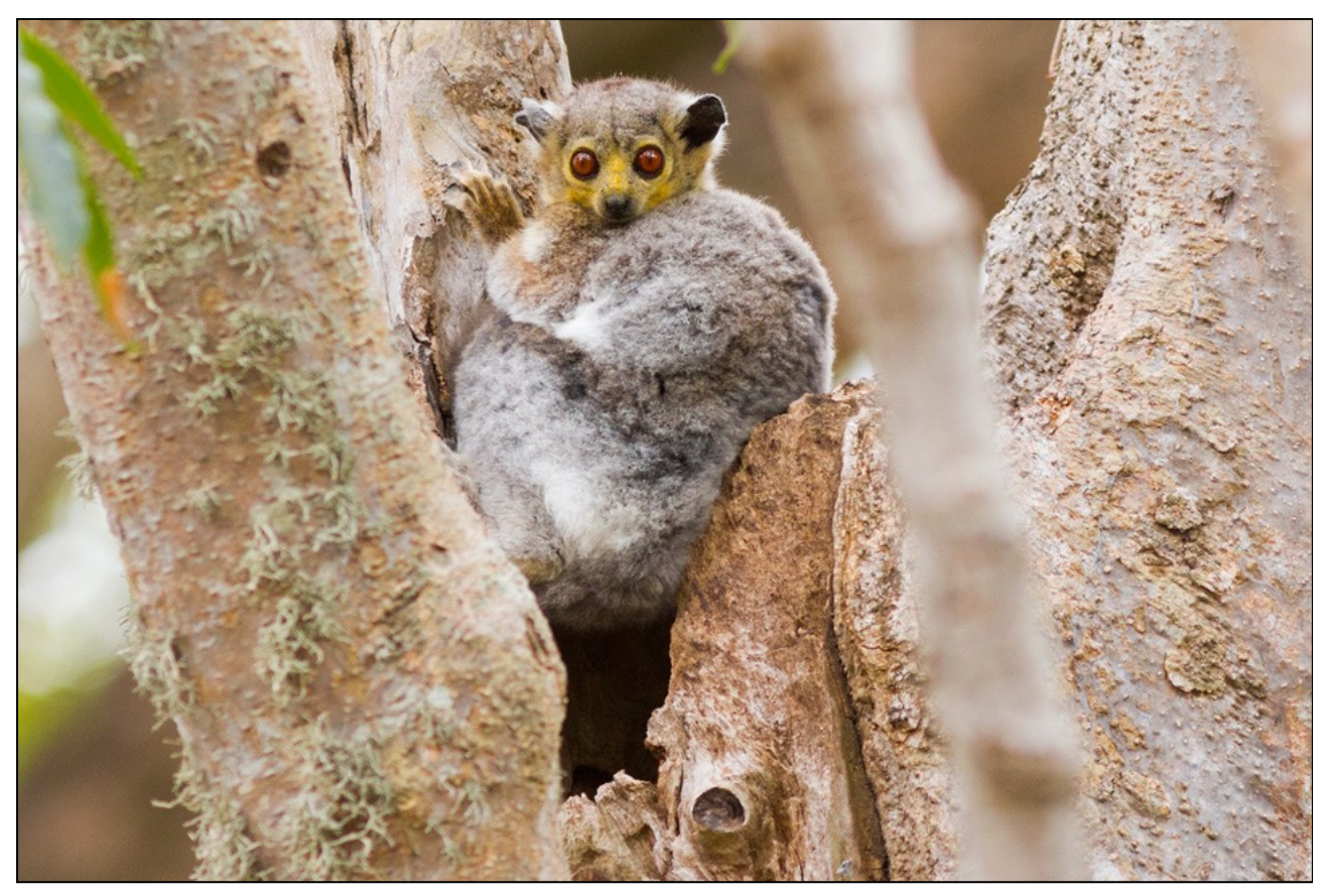
The White-footed Sportive Lemur was common during the night hikes at Berenty, and here during the day