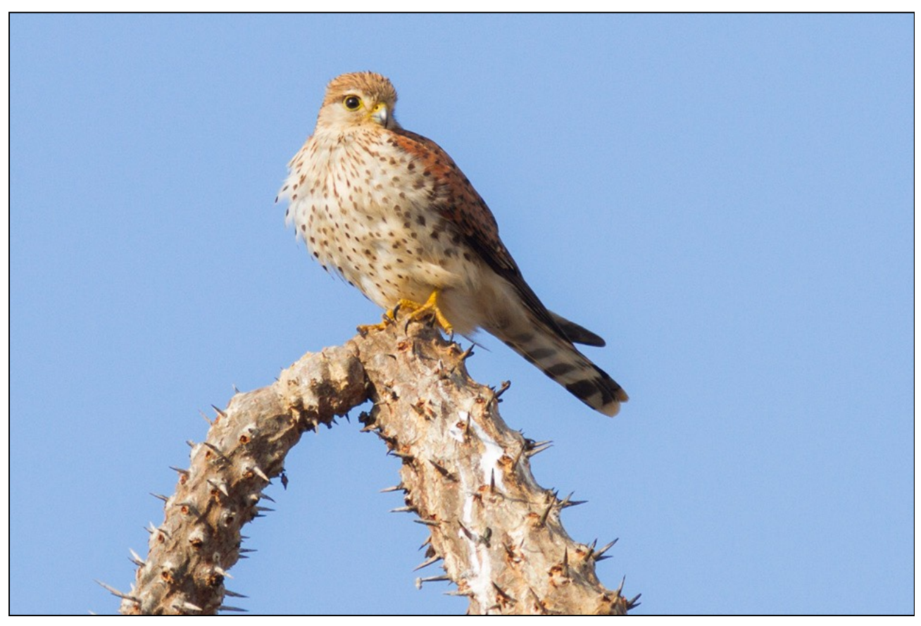
Madagascar Kestrel was common throughout, but the best views were at Reniala Private Reserve