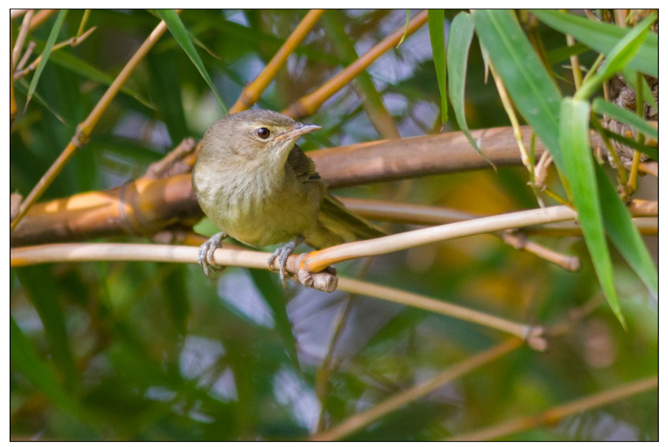
Madagascar Brush Warbler is a common endemic at Lac Alarobia

Our second day in the country began with an early morning, a quick breakfast and a Madagascar Hoopoe seen at the hotel. We wanted to arrive early to <u>Lac Alarobia</u>, a great birding spot in the middle of the city, with high numbers of waterbirds, including 5 species of ducks and several herons and egrets. Our first sight was the high numbers of White-faced Whistling and Red-billed Duck . Among them, a few endemic Meller's Ducks made their appearance, our first new endemic of the day. The island in the middle of the largest lake was completely covered with breeding herons, specially Squacco Heron and Little Egret , but also Black Heron and Black-crowned Night-Heron . It took us some time to find one of our targets for this location, but we finally spotted three Madagascar Pond-Herons , with spectacular white crests and bright blue beaks. The Malagasy Kingfisher is common here, and can be seen perched at very close distances, as can the Madagascar Coucal .