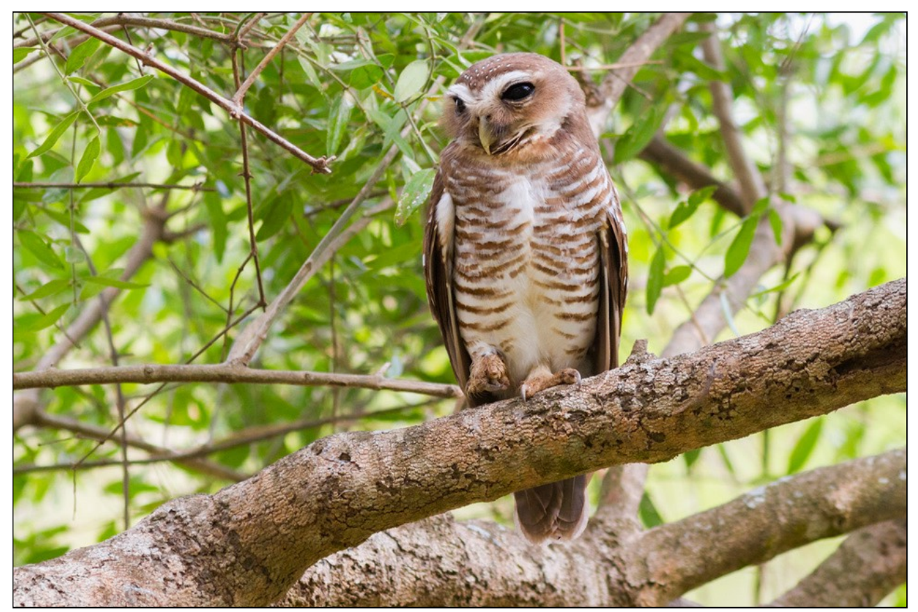
We saw three White-browed Owls during the day at Berenty - what a treat!

We only had one full day in <u>Berenty</u>, and we made the most of it. In the very early morning we took a walk through a trail in the Deciduous Forest. Here, we had our first Verreaux's Sifaka , as well as the Ring-tailed Lemur , which is very common in the reserve, even visiting the restaurant during breakfast hours! It's worth mentioning that there is a small, introduced, hybrid population of Red fronted Brown Lemur x Collared Brown Lemur in the reserve, which we also saw during our stay. Aside from the lemurs, the birds were very cooperative. We saw: Madagascar Green- Pigeon , up to 6 Crested Coua , Lesser Vasa-Parrot , Madagascar Paradise-Flycatcher and Madagascar Cuckooshrike , among others. But the real stars of the morning were the owls, with fantastic views of White-browed Owl and Torotoroka Scops-Owl . We finished the (first) hike of the morning observing a tree packed with Madagascar Flying Fox and a busy colony of Sakalava Weaver . We took a second walk in the Gallery forest after a restorative breakfast, and with the company of a family of Ring-tailed Lemurs, got good views of Hook-billed Vanga , Madagascar Sparrowhawk and Giant Coua as the main highlights.