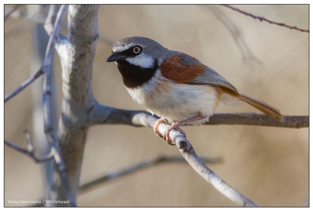
Male Red-shouldered Vanga, seen well at Le Table, near Tuléar

This afternoon, we took one last trip to <u>Le Table</u>, with the main purpose of seeing the Red-shouldered Vanga . It took some time, but after about 15 minutes we got the response of at least one individual, so we walked rapidly into the dry forest, and even though it took 5 more minutes, finally we had great views of both a male and a female. The best way to end our full day in Ifaty!