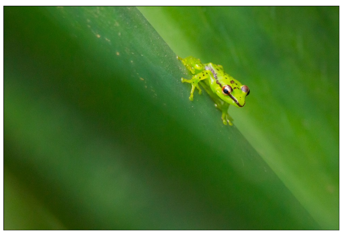
Tsarafidy Madagascar Frog on a Pandanus leaf, Ranomafana NP

maybe four individuals near the path, and we found them with relative ease. We had excellent views of one of them, right after we got a White-throated Oxylabes and a nest! Other highlights during the morning were Rufous Vanga on a nest, several Madagascar Blue-Pigeon (beautiful birds!), Blue Vanga and several species of lemurs, including the highly localized and Critically Endangered Golden Bamboo Lemur .